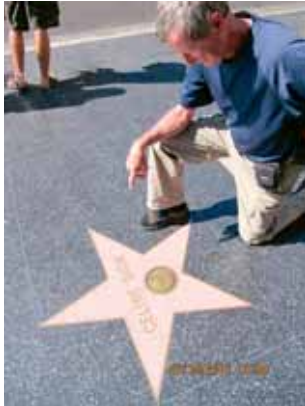
The Boulevard of the stars in Hollywood pays tribute to a large number of artists and extends over several kilometers. We managed to find Céline Dion's star.

years ago. She had climbed a ladder to prune a tree when the branch accidentally touched an electric wire, she was thrown to the ground. Fortunately she didn't break anything but it kind of slowed her down a bit. However, we learned that she passed away last fall.