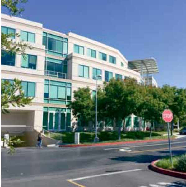
Apple front panel. It is forbidden to take pictures in the building or go further than the entrance hall

opment of San Francisco to the north, crossing a 1.6-wide strait km. An impressive number of pedestrians travel to the first pillar by a sidewalk of about seven meters in width, from which one has an extraordinary view of the city and the inner bay. With our bikes, we crossed the bridge