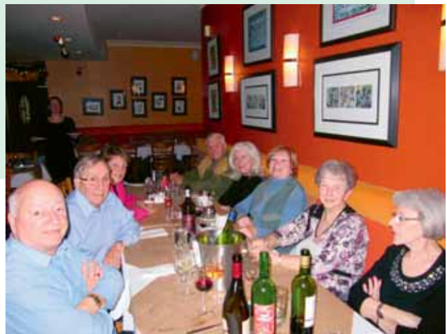
Volunteers seated round the table

This is the time to thank in a good mood the volunteers for their dedication and involvement in the various projects.