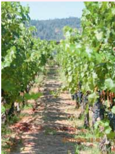
Rows of grapes in the vineyard Robert Mondavi, one of the most important and ancient in Napa Valley

Friday, August 12 th , time to return to Los Angeles airport. We took a back road through the country side, very hot and arid, but very good for the growth of fruits and vegetables, thanks