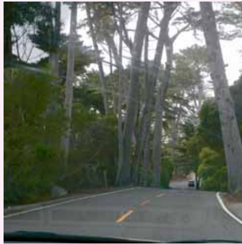
Road crossing the private sanctuary of the Monterey Peninsula in an ancient forest of magnificent cypresses located 200 km south of San Francisco

giant cypress trees and runs along rugged shorelines with few beaches suitable for swimming and constantly battered by fierce winds. Three writers, Henry Miller, John Steinbeck and Robert Louis Stevenson, who in the year 1900 found the place enchanting and spectacular, managed to make it a private sanctuary.