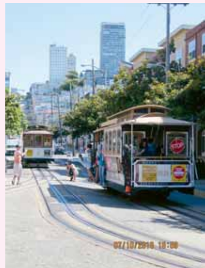
The Cable Car surface metro, towed by an ingenious system of cables and gears, crosses the hills of San Francisco

wanted to destroy everything and rebuild new stuff, but a group of determined residents managed to save three lines where everything is done by hand as before and it has become an incomparable tourist attraction. It is slow, but so pleasant to travel the city without