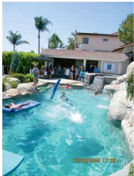
Swimming pool and outdoor meeting place with a poster bearing the logo of the Association