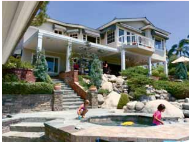
It is the house seen from the back where the family meeting took place. The children spent the day in the wading pool and in the