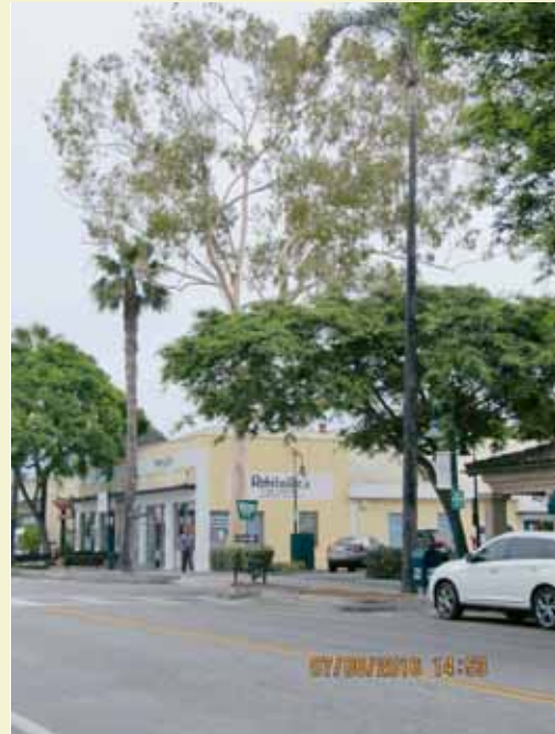
General view of chocolate and candy factory in Carpinteria