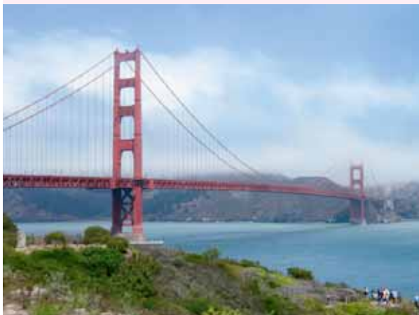
The Golden Gate Bridge that connects San Francisco to northern California by spanning the San Francisco Bay Strait. This technological masterpiece is a tourist attraction since it was built in 1937 and often has the head in the clouds like skyscrapers of San Francisco from elsewhere

opment of San Francisco to the north, crossing a 1.6-wide strait km. An impressive number of pedestrians travel to the first pillar by a sidewalk of about seven meters in width, from which one has an extraordinary view of the city and the inner bay. With our bikes, we crossed the bridge