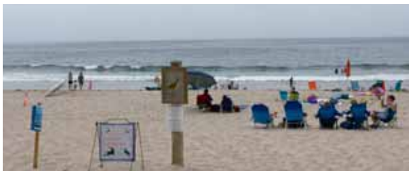
The beach of Carpinteria in front of which a ship of the American Navy docked during the celebrations of the 50 th anniversary of the city.