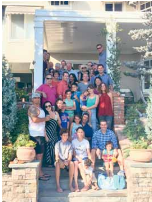
The three families grouped together