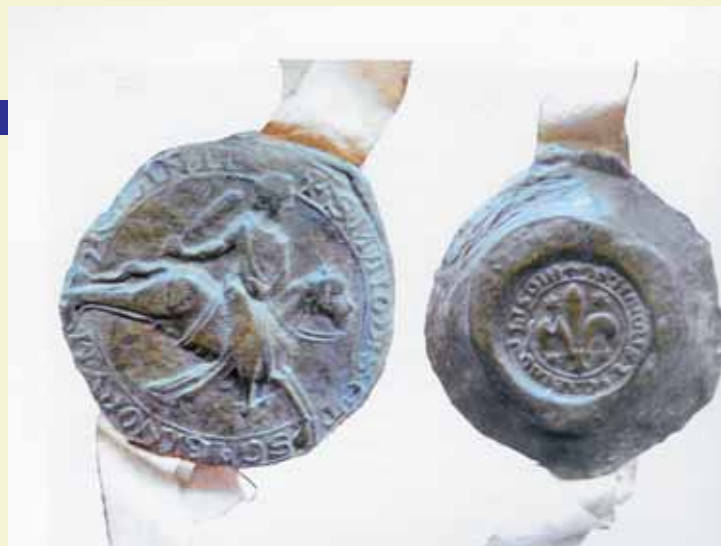
The town of Hesdin had a great 58 mm round seal that was used to seal the laws that it passed. It showed a knight on horseback galloping to his left, clothed in a tunic with a mantle attached to the right shoulder, armed with a kind of club held alongside his body, and holding the reins of his horse in his left hand. There was also a round, 58 mm seal used for non-litigated acts and private acts between individuals since there were no notaries in Artois at that time.

Despite the apparent overlapping of responsibilities, it seems that the rapport between the town and the count were relatively harmonious, except for an event described in the archives of 1316 when some nobles revolted against Mahaut and her hated advisers, and sacked the castle, but they were unable to convince the peo-