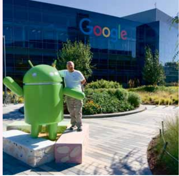
Florent on the terrace opposite Google

from one end to the other with a strong side wind. Exhausted, we decided to come back by ferry. We were not alone to have this idea be-