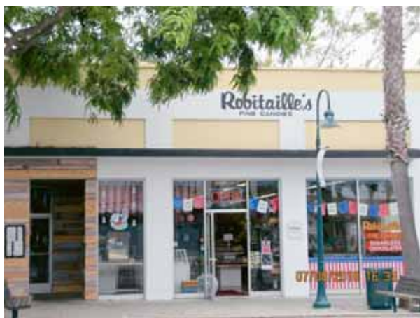
Robitaille's Fine Candies Main Entrance Note that the blue, white and red reflect the special colors of their mints and that the vegetation is indeed that of a warm country