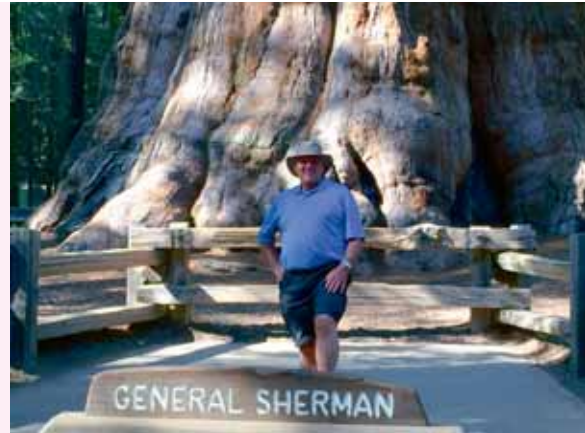
Two national parks showcase the redwoods, huge trees that grow on the western flank of the Sierra Nevada and can live up to 3,000 years. Here the largest is nicknamed General Sherman in honor of a Civil War General of the Civil War. It measures 84 meters in height and has a respectable diameter of 10 meters. No relation to Florent.

to a super-developed irrigation system. We planned to make a one-day trip to visit the giant sequoias halfway, but eventually it took us two days to tour the two adjacent parks where they grow. These trees, which sometimes exceed 80 meters high, can live between 2 to 3000 years. They are rot-proof because they produce tannins, which prevents in-