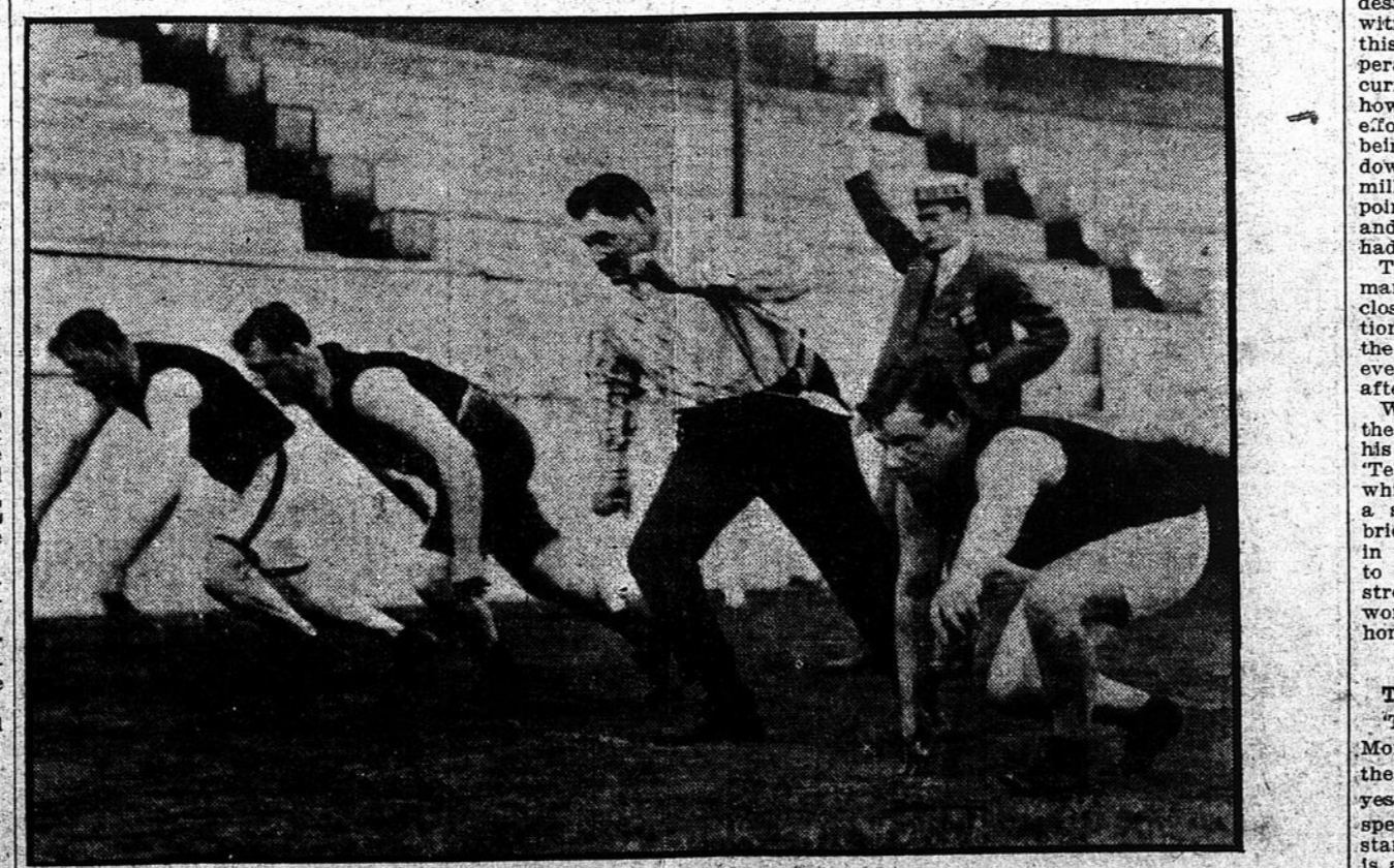
MONTREAL POLICE SPORTS.—START OF THE FAT MEN'S RACE.

Politicians who were in Ottawa yesterday, seem satisfied that dissolution will come at the end of next week, and that the elections will take place between September 15 and October 15—probably not later than October 1.