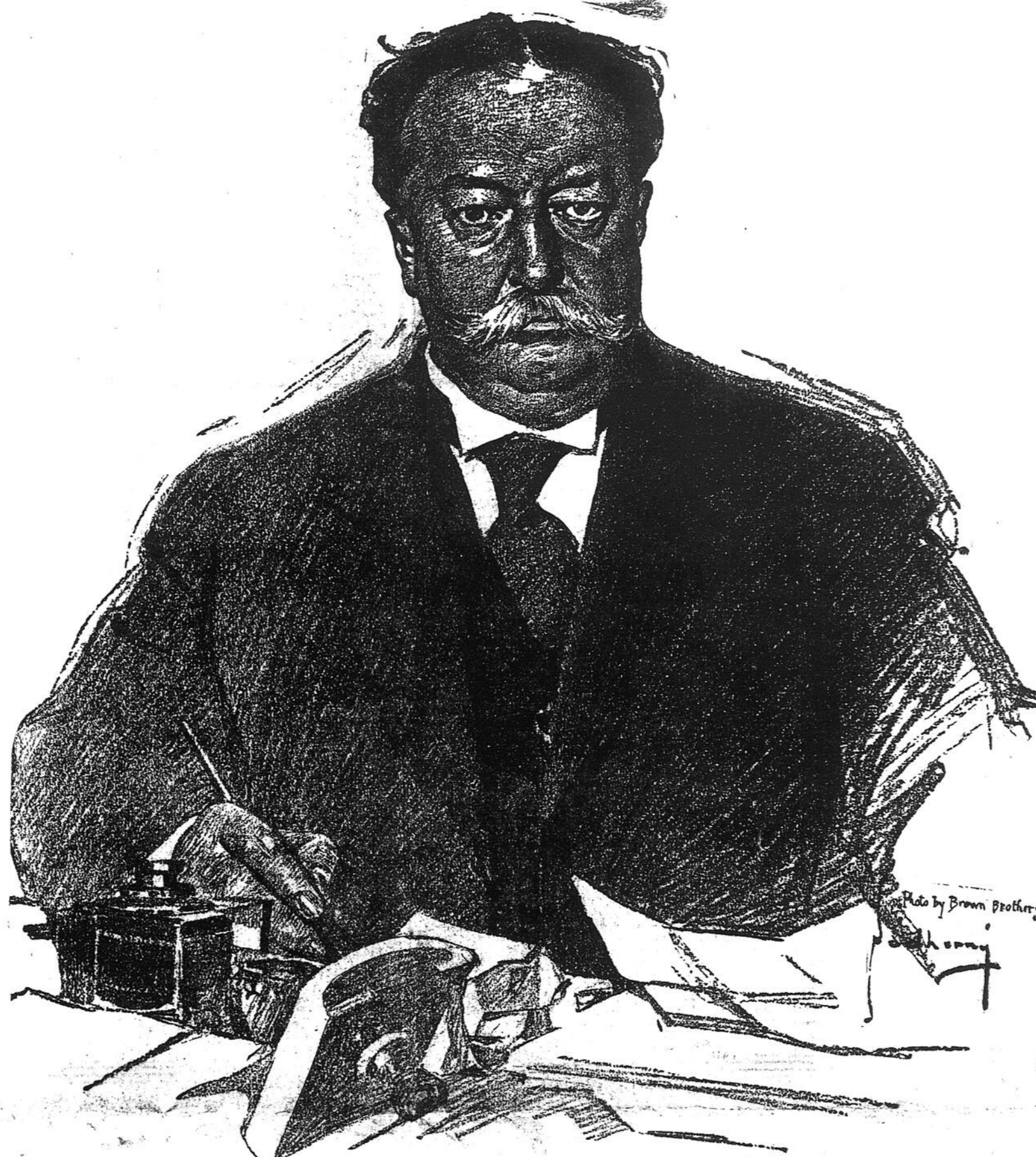
WILLIAM H. TAFT.