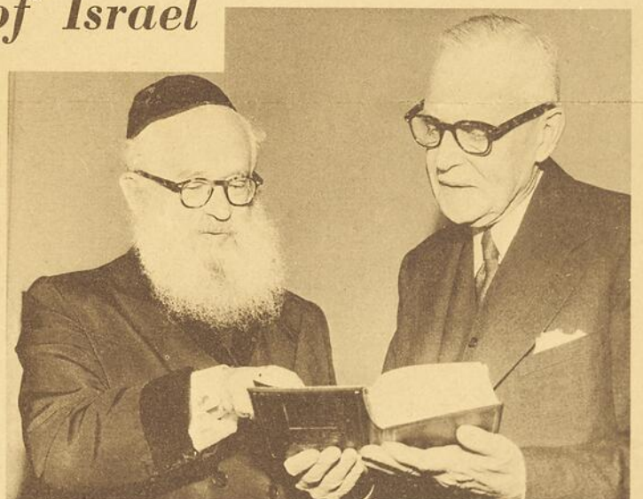
In Ottawa, Hon. Louis St. Laurent, Prime Minister of Canada, receives a copy of the Old Testament from Chief Rabbi Herzog, one of the first printed in Jerusalem following the establishment of the new State.

His trip to this country was under the auspices of the Mizrahi Organization of Canada with certain aspects in cooperation with the Canadian Jewish Congress, the United Zionist Council and the Montreal Board of Jewish Ministers.