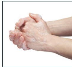
RUBS FOR 15-20 seconds