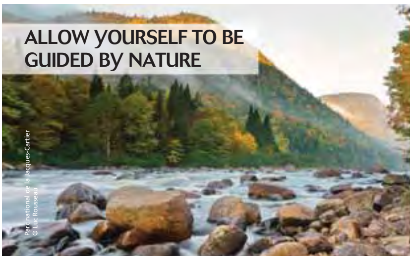
Parc national de la Jacques-Cartier

The outfitters, members of Aventure Écotourisme Québec, in collaboration with the Sépaq, offer you several stays and guided activities specially conceived to have you discover exceptional natural spaces.