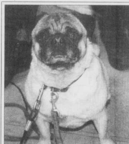
Baloo is a 2-year-old pug. He enjoys being with us and the other dogs but he is craving a quiet and loving home. If he could be, he would be a lap dog.