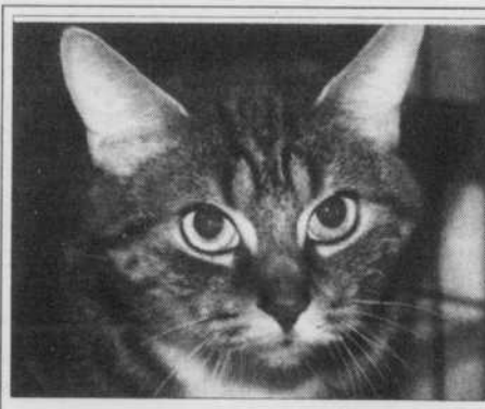
Lisa is three years old. She craves attention and is starving for a loving family to call her their own. She will talk to you and rub up against you all day if she could. She isn't so cordial with other cats, so she needs to be in a home where she can get all the cat love.

This page is provided by Blue Seal - The Animal Nutrition Centre and The Pet Connection.