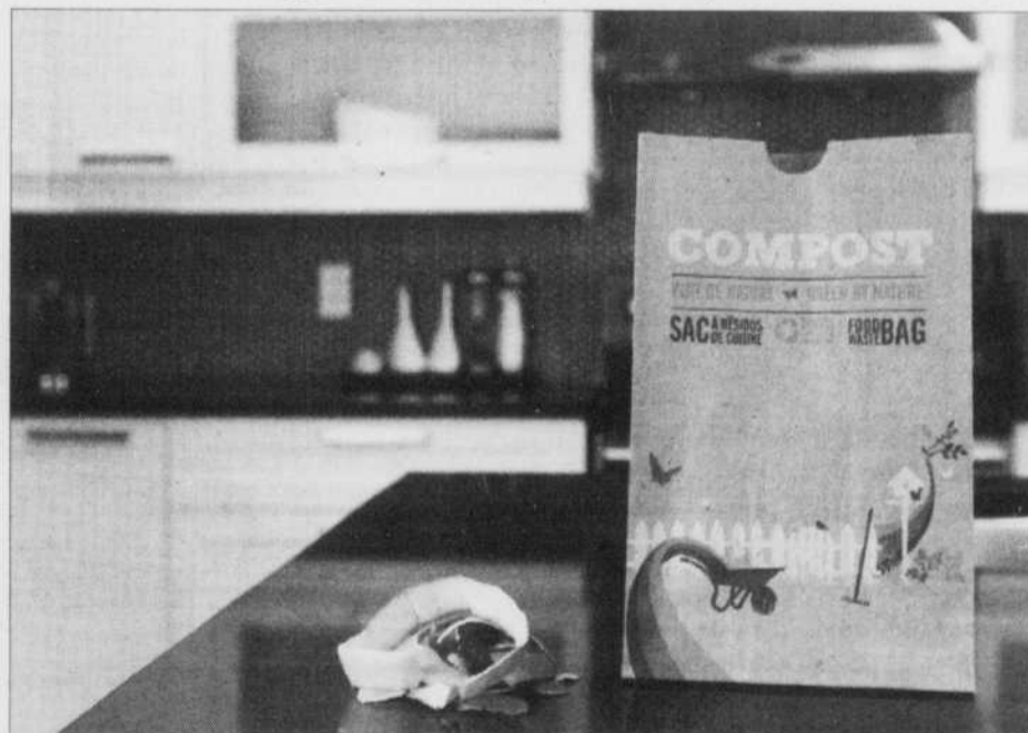
Yard Waste Bags

If every family in a small city of 10,000 homes used two 100 per cent recycled food waste bags, rather than bags made of virgin fibres, every week for a year, the cutting of more than 660 trees, about the size of two football fields, would be avoided.