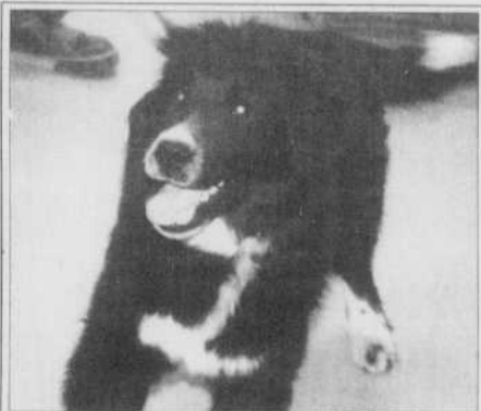
Barnaby is a 6-month old Bernese mountain dog and Border collie mix. He is a typical puppy. Needs leash training, loves to clumsily run and play and is very affectionate. His brother has found a home, but he hasn't yet and deserves his own new start at life. Come and visit him.