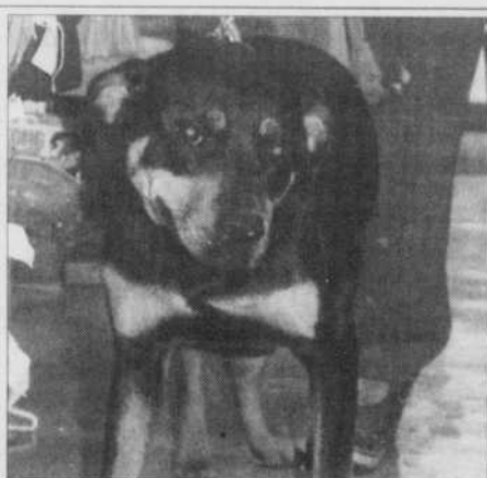
Harley is a 2-year-old Rottweiler. She is small and will stay smaller. She is good with other dogs, but can get impatient, which is why she needs a patient owner. She will make a good pet.