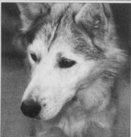
Ice is a year old. She is a husky mix. She likes to play but is calm and likes to lie around and watch TV too. She is good with other dogs and cats.