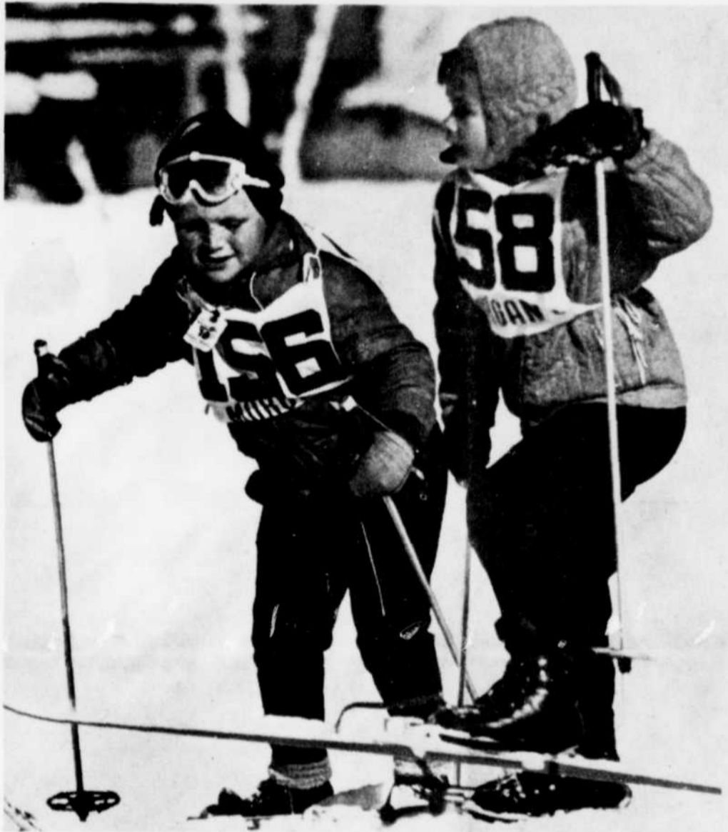
A COUPLE OF 1984 WINTER OLYMPIC HOPEFULS TEST THE SNOW

"We get a lot of children from the schools around here," said Poderieszch. "But I'll give you a better example of how popular this thing has become. The cottages along Lake Memphramagog here used to be just for the summer, but now people are winterizing their homes and coming for ski weekends with the whole family."