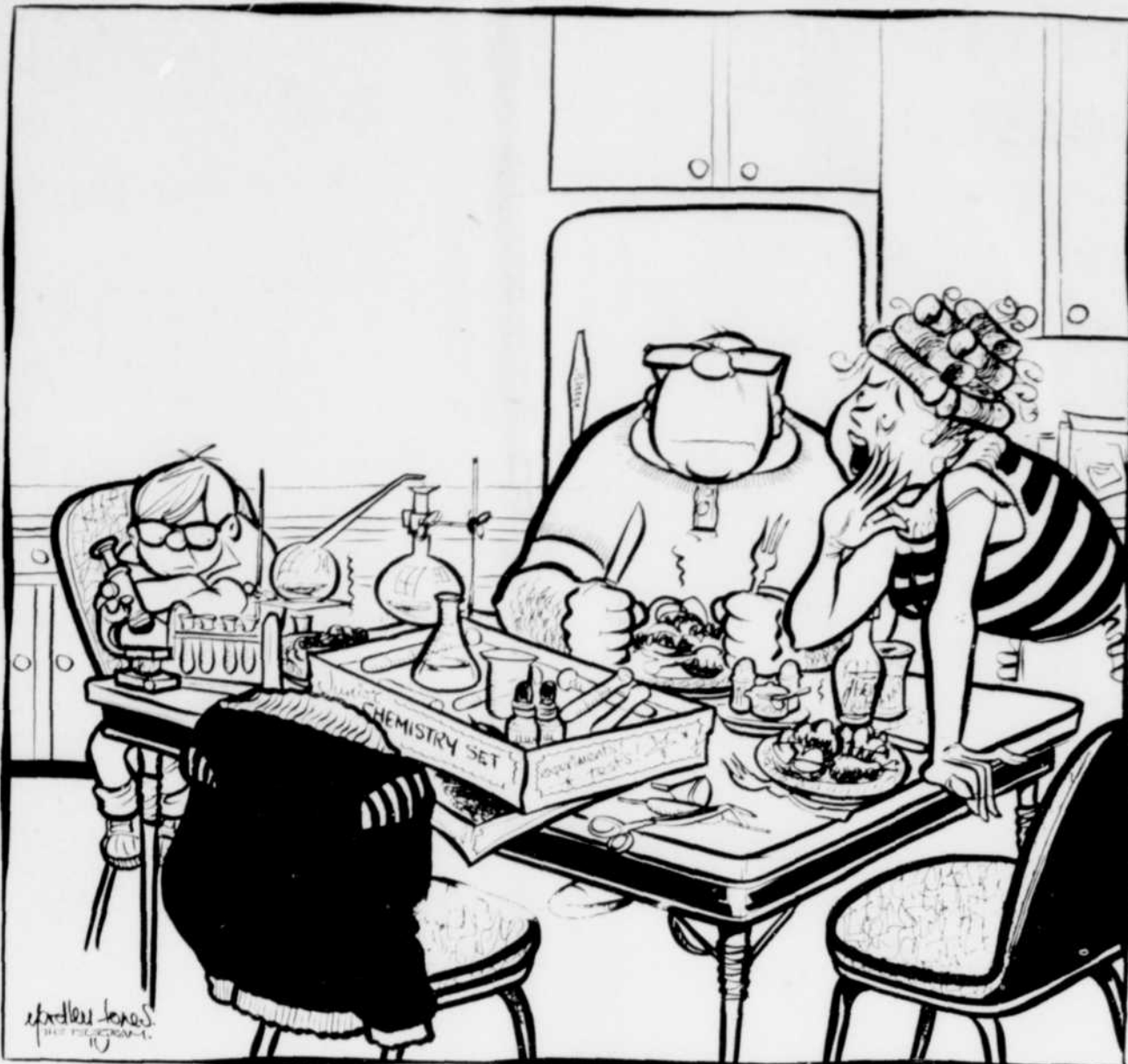
"But then - how do we know there ISN'T any mercury in his spinach . . . ?"

And the folly of these regulations is evidenced by the probability that a brilliant non-Canadian children's show - Sesame Street - may have dropped from the Canadian air waves because of the CRTC ruling.