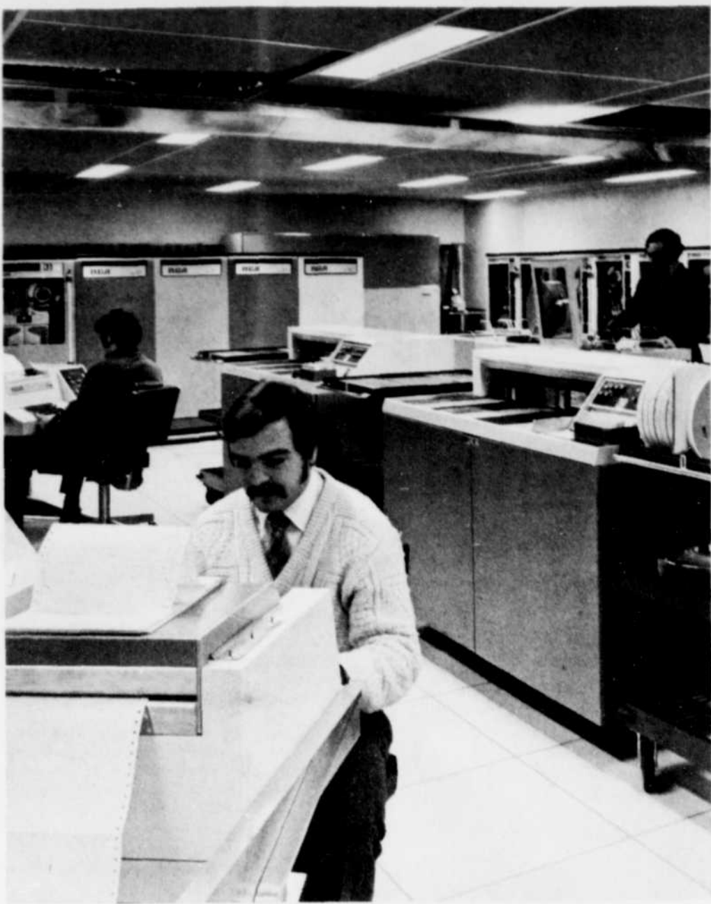
ACTION CENTRAL — The computer room in the Quebec Health Insurance Board's headquarters in Quebec City is where all applications and claim forms are processed.

The outcry against medicare has diminished considerably since November with the general practitioners,