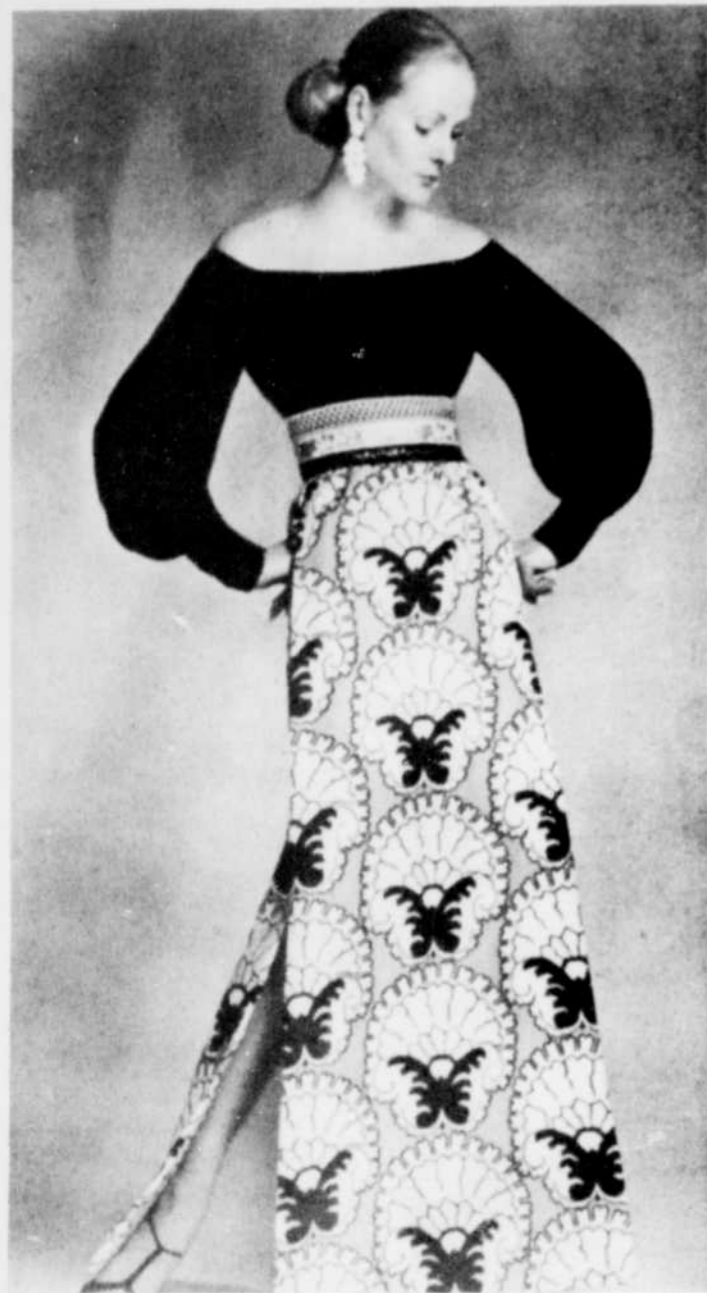
PARTY DRESSES COMING BACK — This late-day dress by Malcolm Charles features a black jersey top which bares the shoulders and a black, yellow and white surah print skirt. The high midriff is banded in gold braid and flower woven ribbon.