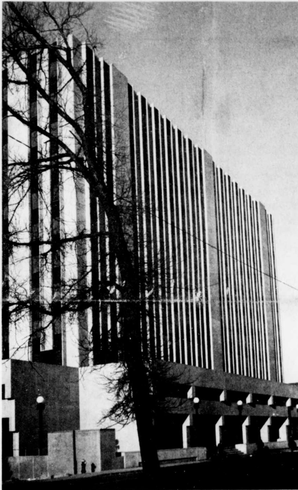
HEADQUARTERS: Housed in this imposing new office building in Quebec City, the Quebec Health Insurance Board administers the controversial two-month-old medicare program. For a full report on medicare's effects in the Sherbrooke area, see page 5.

NEW YORK (Reuter) — United States Army intelligence agents spying on radical groups apparently took seriously an alleged plan to hijack a Staten Island ferry and order the captain to go to Cuba, the New York Post reports. The story says agents assigned to a military intelligence group in Manhattan said a group called The Crazy's planned to board one of the ferries that ply between Manhattan and Staten Island and demand the captain to take them to Cuba. "When the captain obviously refuses to do so, they plan to rush to one side and threaten to 'tip the boat over,'" the army report is quoted as saying.