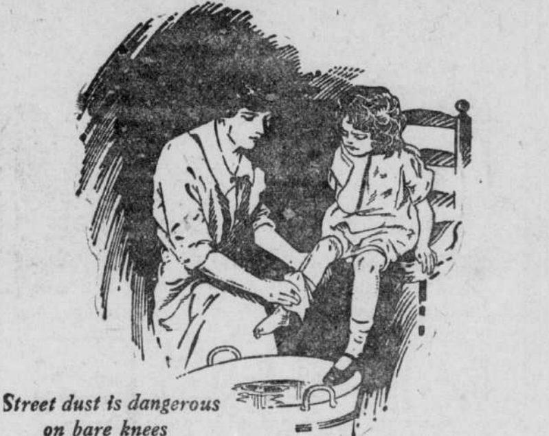
Street dust is dangerous on bare knees