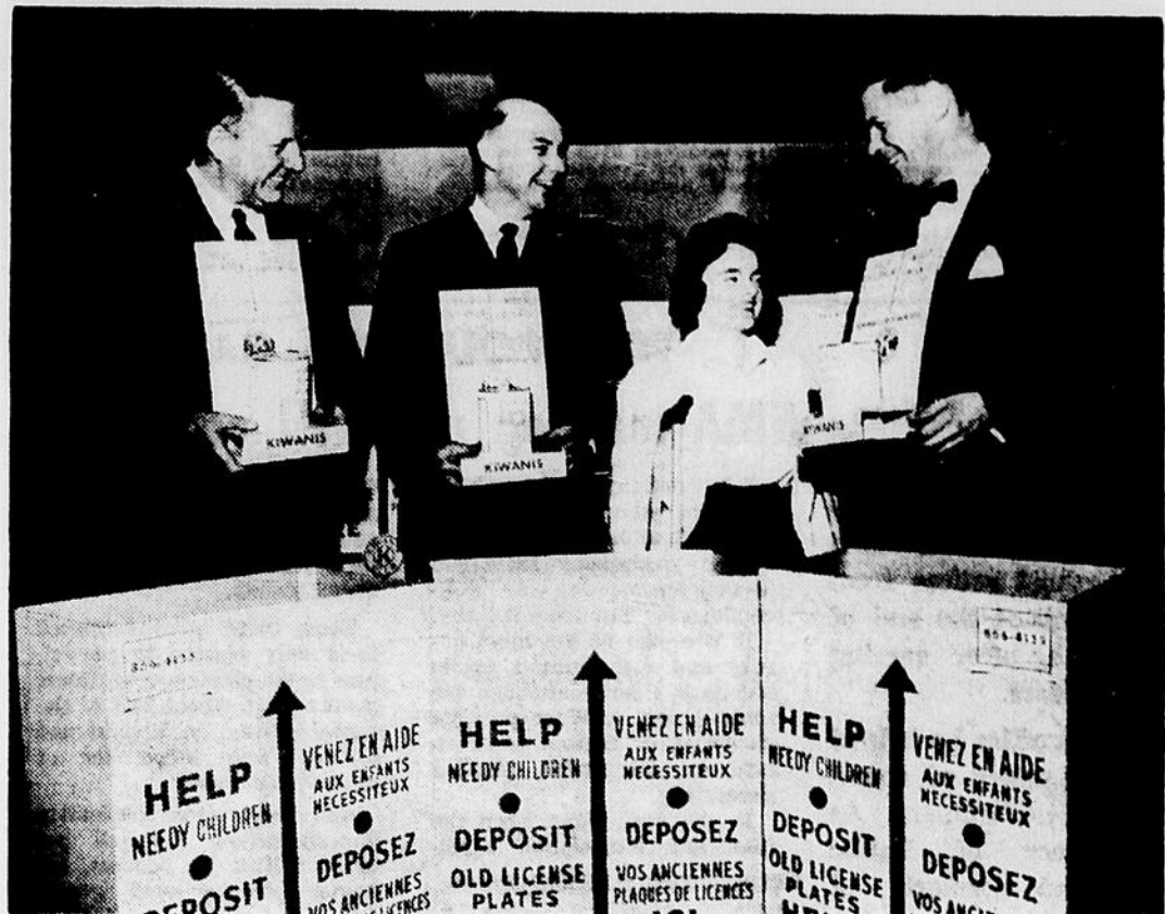
PLATE N'PENNY DRIVE

House of Flowers INC. ... for Beautiful Flowers MOUNTAIN STREET AT SHERBROOKE VICTOR 2-4444