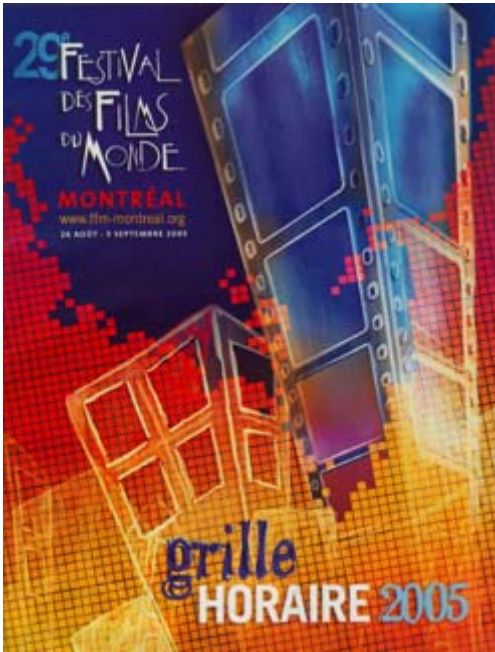
The World Film Festival 2005