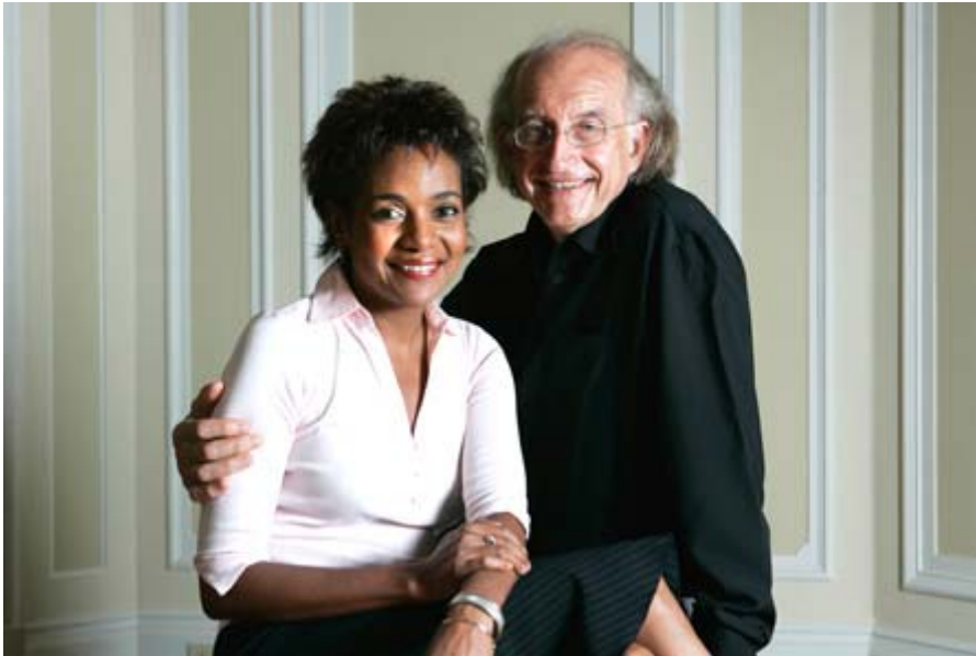
Michaëlle Jean and Jean-Daniel Lafond

The next Governor General of Canada, Michaëlle Jean and her husband, the Film writer Jean-Daniel Lafond, attracted the attention of the media since the announcement of this nomination.