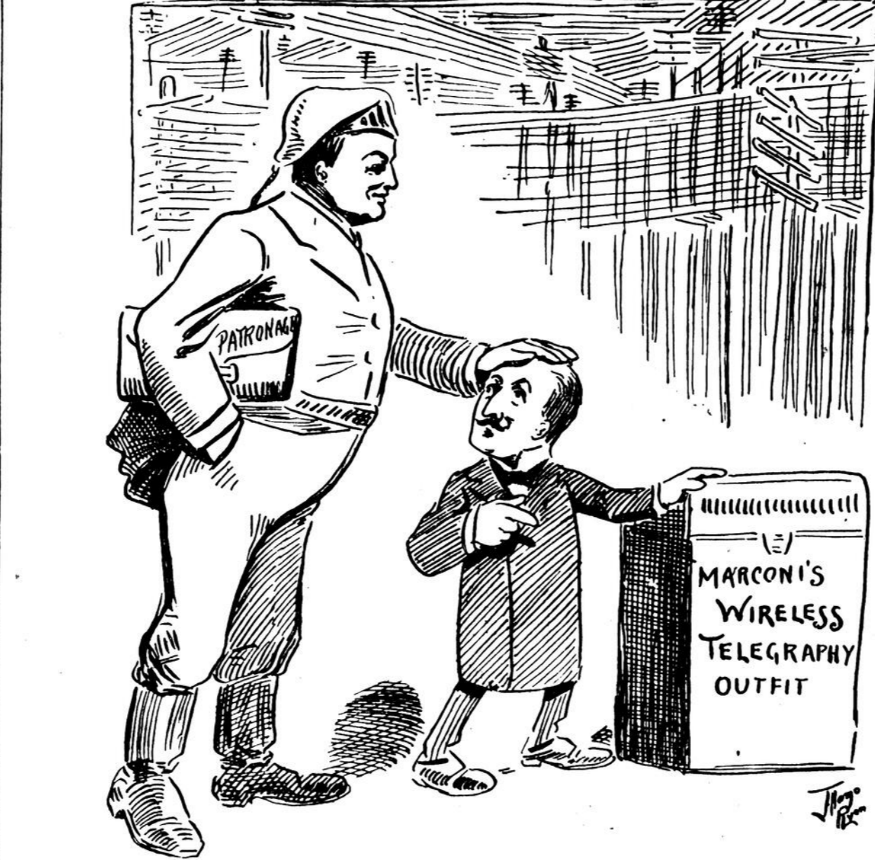
CANADA'S LATEST ACQUISITION. JOHNNY CANUCK—"Go ahead, my boy. Do away with the wires and the poles, and I'll be a father to you!"

Probabilities: Mild and rainy until Thursday forenoon, then clearing by evening. Minimum and maximum temperatures: Dawson, 36 below, 10 below; Victoria, 44-48; Kamloops, 32-36; Calgary, 22-46; Winnipeg, 28-46; Qu'Appelle, 24-30; Port Arthur, 25-46; Darry Sound, 32-30; Toronto, 32-41; Ottawa, 26-42; Montreal, 24-42; Quebec, 18-38; Halifax, 27-38. Readings by Hearn & Harrison's standard barometer: At noon yesterday, 30.09; 8 a.m. to-day, 29.84; 11 a.m. to-day, 29.82. Temperature: To-day, maximum 44, minimum 38; yesterday, maximum 48, minimum 24.