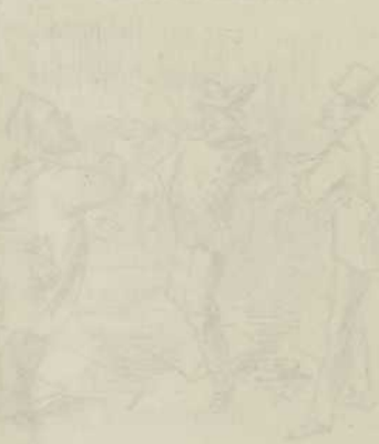
The Editor's first experience of the world.