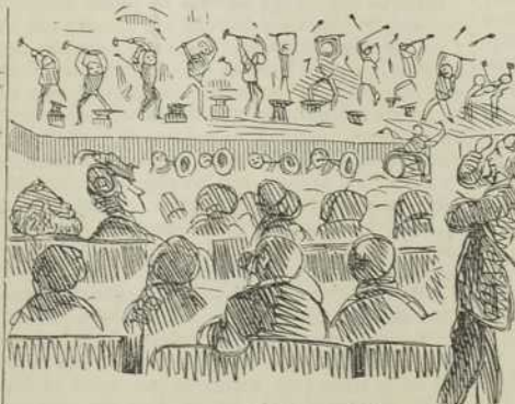
He attendeth ye Jubilee, and is particularly struck with ye "Anvil Chorus."