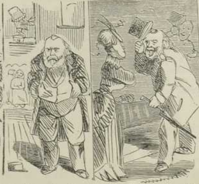
He determineth on going South, And taketh leave of his charming friend.