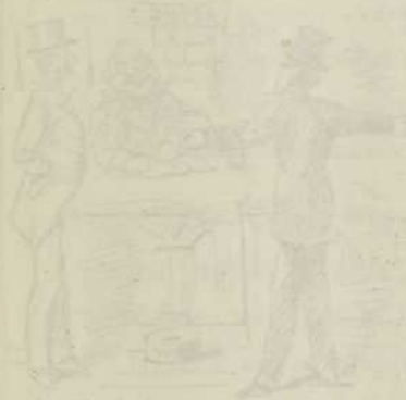
The Editor's first experience of the world.