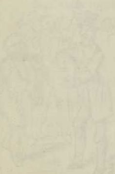
The Editor's first experience of the world.