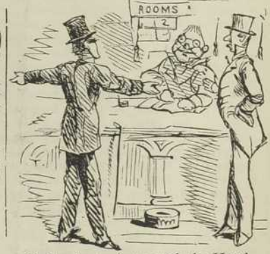
Ye Conductor instructeth the Hotel-keeper to "watch that man."