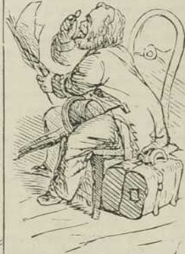
And awaiteth a cab to drive him to a Hotel.