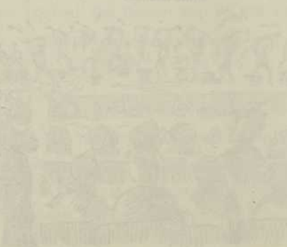
The Editor's first experience of the world.