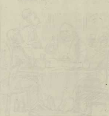
The Editor's first experience of the world.