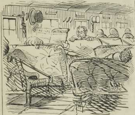
And intently regardeth the other side of ye Daily Witness .