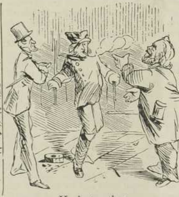
He lectureth a Bar-room loafer.