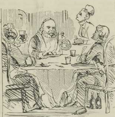
And dineth with some friends.