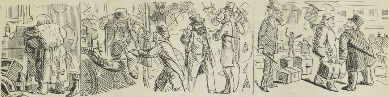
Ye Editor prepareth for his journey.