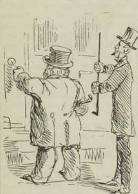
He maketh a morning call.