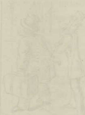
The Editor's first experience of the world.