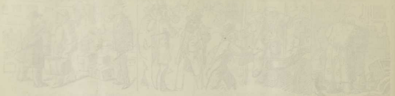
The Editor's first experience of the world.