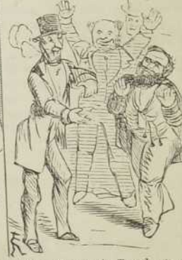
Ye Through-Conductor returneth to Montreal and reporteth all "O.K." to ye "humorous ticket agent."