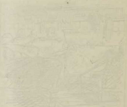
The Editor's first experience of the world.