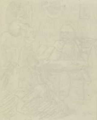
The Editor's first experience of the world.