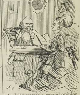
And requesteth a candid opinion of ye New Dominion Monthly .