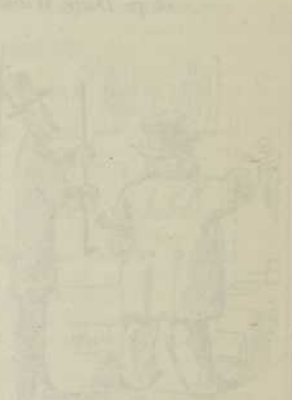
The Editor's first experience of the world.