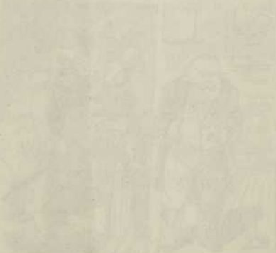
The Editor's first experience of the world.