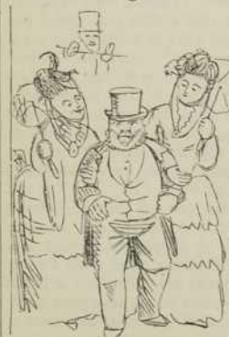
He is ye pet of Sorosis.