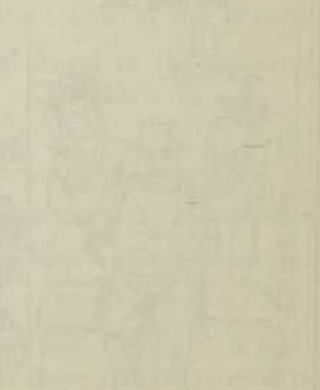
The Editor's first experience of the world.