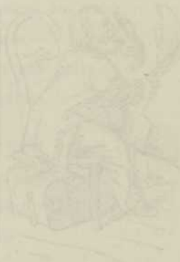
The Editor's first experience of the world.