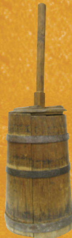
Butter churn Musée québécois de culture populaire

Pointe-à-Callière and HISTORIA invite you to make some discoveries in Acadia. You could win a trip for two to the Maritimes!