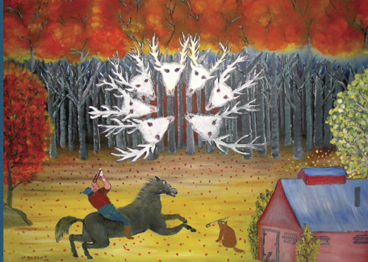
Jean-Claude Dupont La bête à sept têtes [The seven-headed beast] /Jean-Claude Dupont collection

Discovering Legends presents close to one hundred legends, through some forty original naïve paintings bringing the legends to life. There is also a selection of about sixty objects from the 17th to 20th centuries, evoking various legends more clearly and helping visitors to understand them. These come from the Robert-Lionel Séguin collection of the Musée québécois de culture populaire, and represent the traditions and lifestyles of Quebecers from days