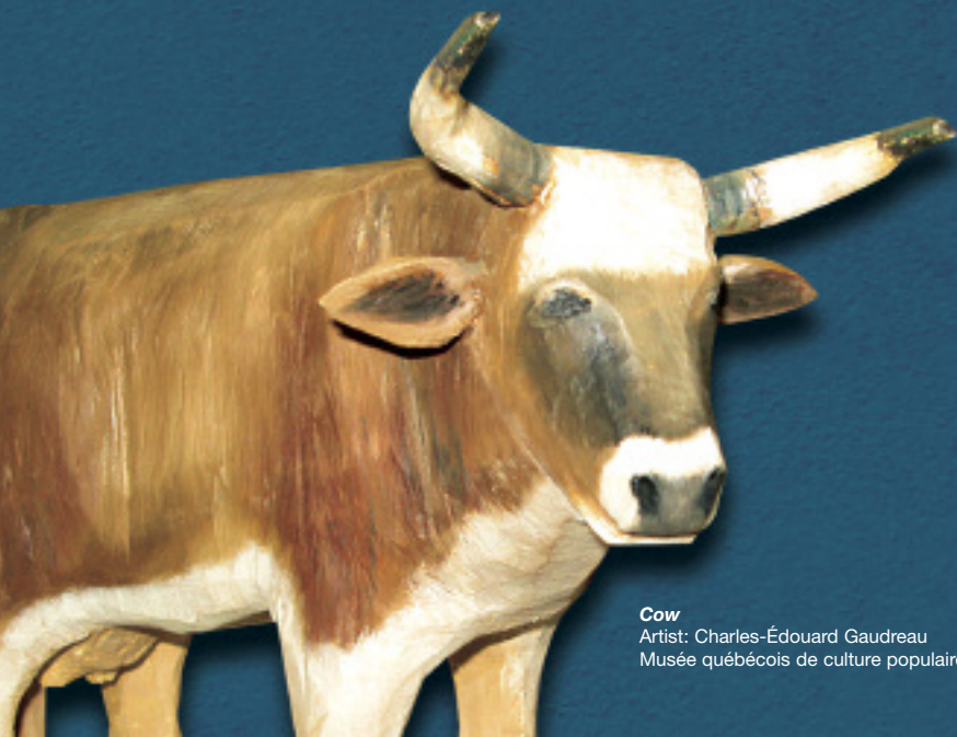
Cow Artist: Charles-Édouard Gaudreau Musée québécois de culture populaire

The rich and colourful exhibition pays particular attention to the many characters that people the different legends. Some recurring themes naturally crop up: the concept of good and evil, omnipresent in legends, and nature itself, which was more than just the environment in which these storytellers of yesteryear lived. It was a source of mysteries and a way of explaining the world. Other frequently recurring aspects of legends also come in for attention, for instance tales based on historic events or actual facts. All these elements, events and characteristics translated the concerns of an entire community and played a key part in its development. Now we have the opportunity to better understand its collective unconscious.