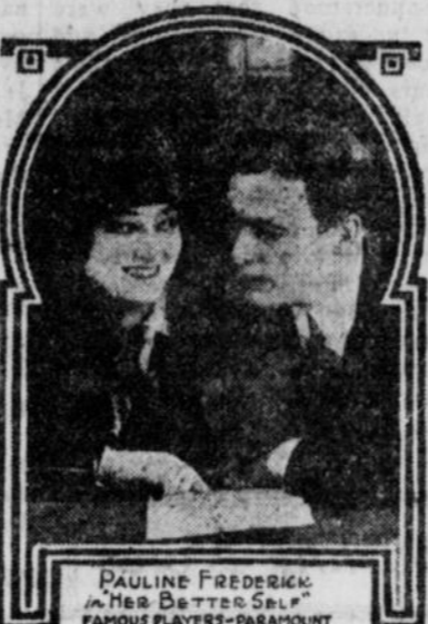
PAULINE FREDERICK "HER BETTER SELF" FAMOUS PLAYERS-PARAMOUNT

Today is a Big Day at Empire—Today, marks the first run of the famous Paramount programme at this theatre and the first picture to be shown will be: "Her Better Self" featuring the greatest of all great screen stars: "Pauline Frederick". But that is not all. Who else do you think is on the bill? Charlie Chaplin—the comedian who will draw down one million dollars for a year's posing for pictures. Do you think he is worth it? See him in "The Count" today and count the laughs. After you count a thousand, count in all your own smiles and you'll find the total will be almost two thousand. And besides—Today, the Empire management, out of the fullness of their hearts, will present to each lady attending the matinee performances a box of Beaumont chocolates. The Price of admission is only ten cents. "Her Better Self."