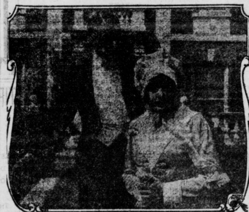
SCENE FROM "THE SECRET OF EVE"

TODAY AND TOMORROW SEE YOUR SCREEN FAVORITE MME. PETROVA.