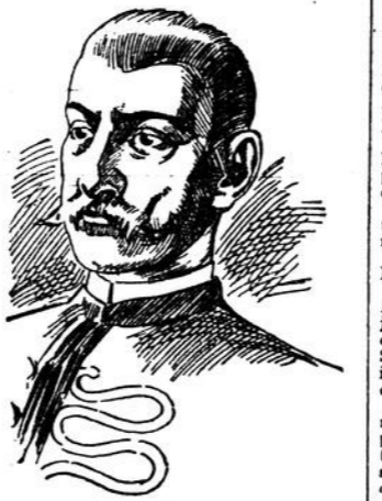
COUNT ESTERHAZY, Who is Now Plainly and Openly Charged With Being the Traitor for Whose Crimes Dreyfus is Suffering.

remember, was the object of a special attack on the part of Zola for his "melodramatic" antics with Dreyfus when that officer was imprisoned, awaiting trial, in the fortress of Ham. In the meantime, Zola, in Paris, is looked upon as mad by his colleagues, a curious recommendation for a man charged with such a grave crime.