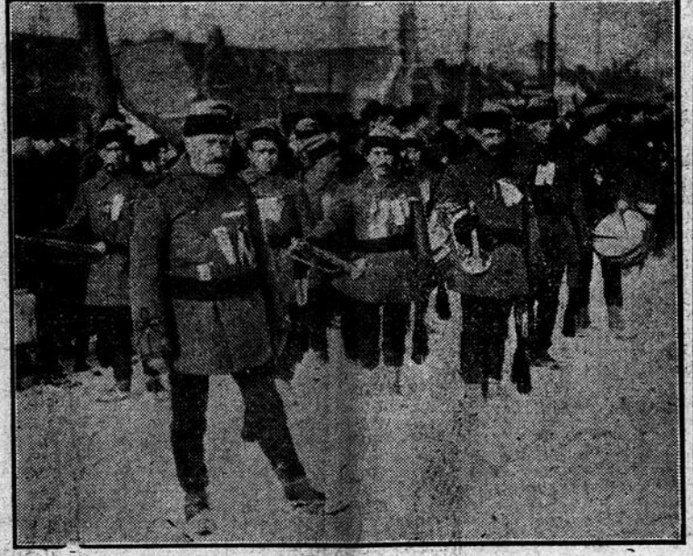
The Bugle Band of the Zouaves, of Quebec.