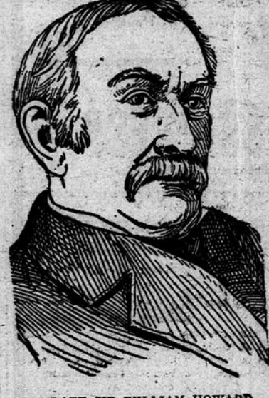
THE LATE SIR WILLIAM HOWARD RUSSELL.

Sir William Howard Russell, Knight (created in 1895), LL.D., D.L., F.I.L., F.R.G.S., F.Z.S., etc., editor of the 'Army and Navy Gazette,' barrister of the Middle Temple, 1832, was born in