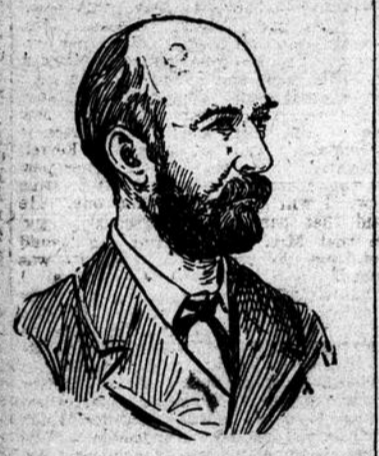
SIR ROBERT HART.

London, Feb. 11.—It is announced that Sir Robert Hart, director-general of Chinese Imperial Customs, will leave China for England at the end of February on a two years' leave of absence, and that he