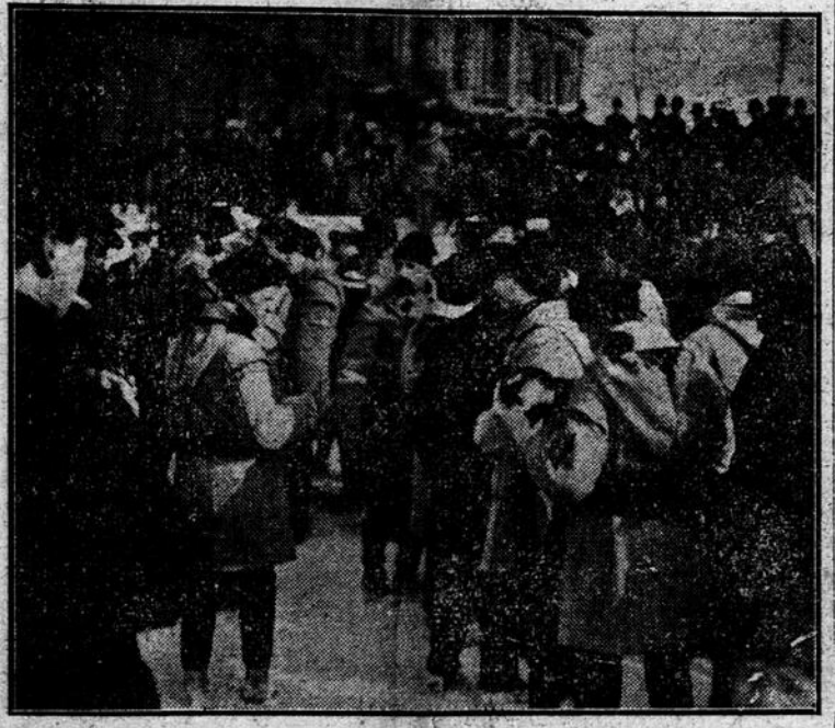
Snowshoers at the muster previous to the parade.