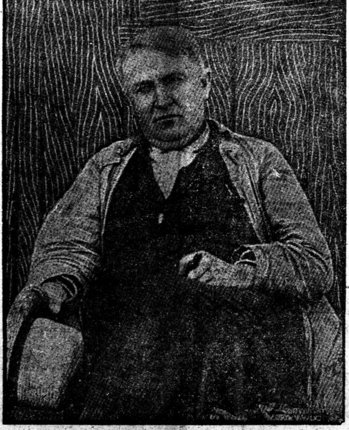
MR. THOMAS A. EDISON.

'Is it possible to foretell what the next great step in the application of electricity to the mechanics of present day life will be?' Mr. Edison was asked. 'I would be a daring man to venture a prediction,' he answered. 'We are all busy collecting data, we investigators, and, may be, in five hundred years more we will begin to suspect something.'