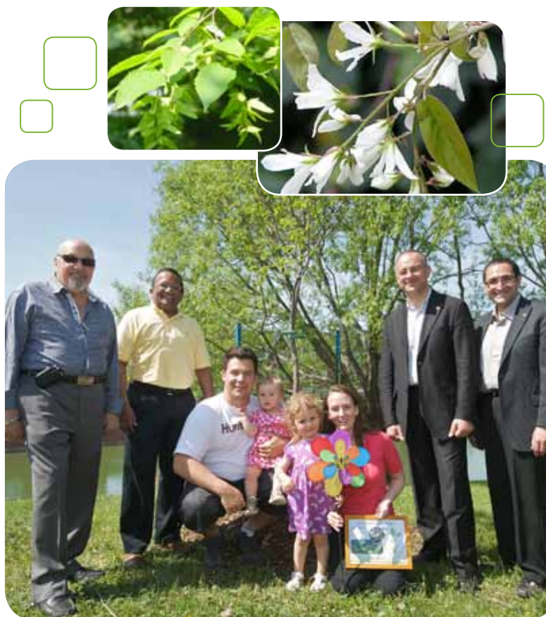
The Borough Councillor for Côte-de-Liesse District, Maurice Cohen, the Mayor of Saint-Laurent, Alan DeSousa, the City Councillor for Norman-McLaren District, Aref Salem, and the City Councillor for Côte-de-Liesse District, Francesco Miele, at the public tree-planting ceremony at Bassin de la Brunante.