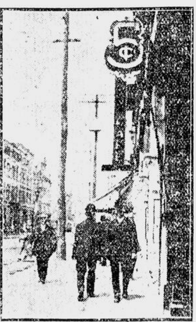
Two signs on St. Lawrence Boulevard, near St. Catherine street.