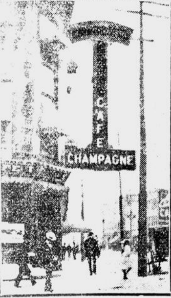
the sidewalk, and Ontario

A café and a five-cent moving picture show, situated side by side so that the signs appear united at a distance, may be seen on St. Lawrence Boulevard near St. Catherine street. While not so prominent as some others, they are