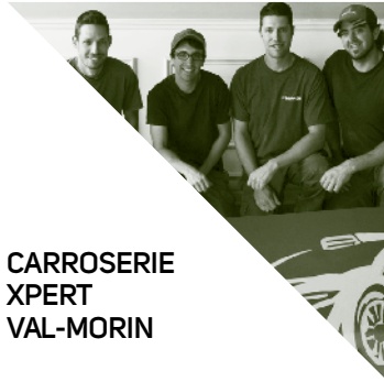
CARROSERIE XPERT VAL-MORIN

A reasonably-priced fashion accessory boutique for women in Mont-Tremblant.