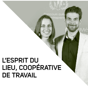
L'ESPRIT DU LIEU, COOPÉRATIVE DE TRAVAIL

Boutique / Café / Bistro / Terrasse / Take-out, in Morin-Heights.