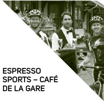
ESPRESSO SPORTS – CAFÉ DE LA GARE

A body shop specializing in auto body repair and car painting in Val-Morin.