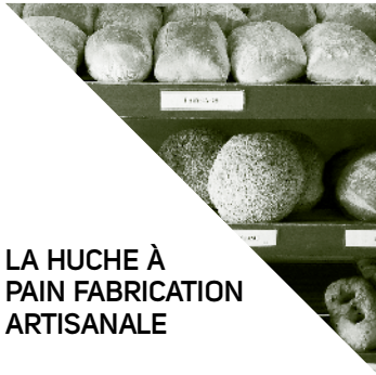
LA HUCHE À PAIN FABRICATION ARTISANALE

Laurentian-based extermination specialists located in Sainte-Adèle.