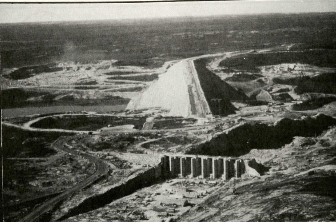
Constructions in James Bay