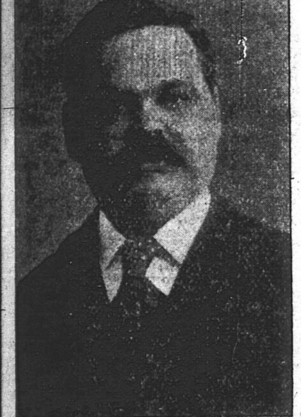
SIR LOMER GOUIN, Who is receiving the Eastern Townships Resolutions.

On Monday evening, as already reported, the Eastern Townships Councils passed resolutions to be forwarded to the Premier.