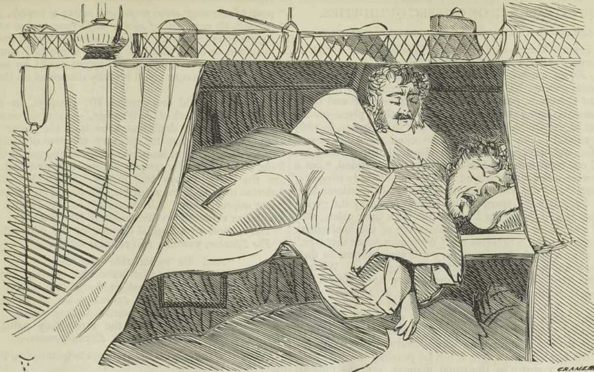
SLEEPING (?) CARS.

Sleeping cars are nearly tolerable, provided one is not put into a berth with a greasy man who snores, puffs, and gnashes his teeth all night.