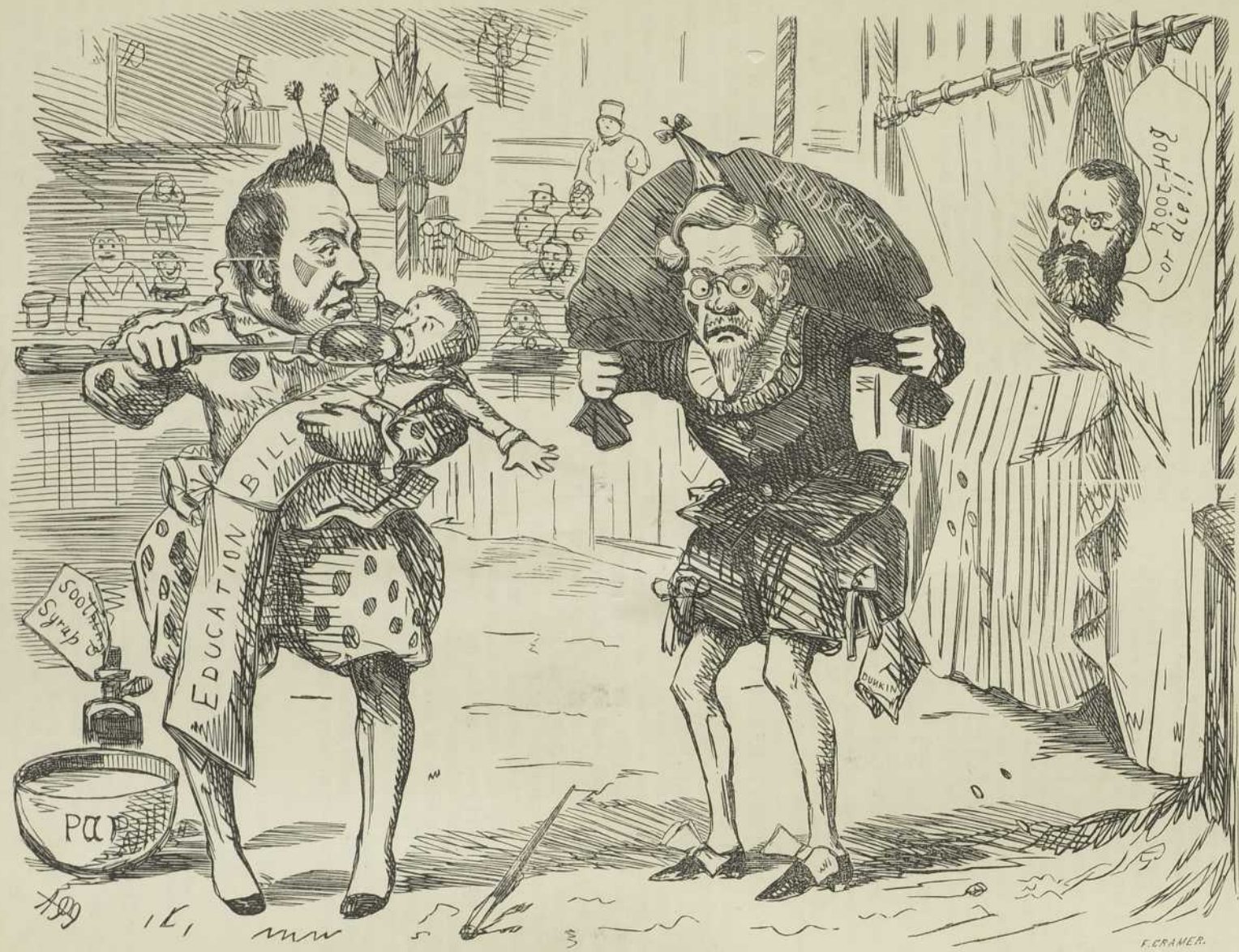
A SCENE IN THE QUEBEC "CIRCLE."