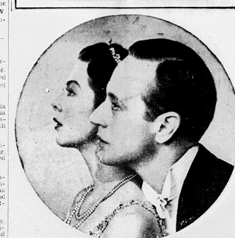
The strangest Cinderella story of all is unfolded in "Pygmalion", filmization of Bernard Shaw's world-famous comedy. In it a London taxicab driver is transformed into a duchess under the magic touch of Leslie Howard, who in the "Business" stage of her transformation will the clock strike at twelve? You'll have to see "Pygmalion" for the answer!