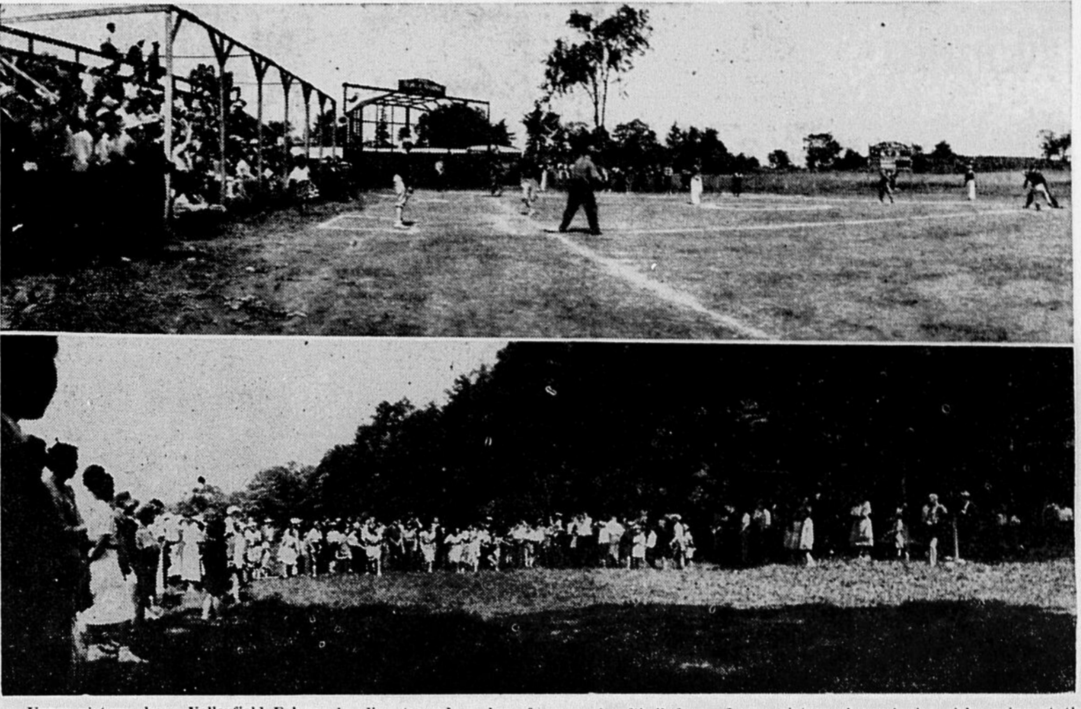
Upper picture shows Valleyfield Falcons heading towards a day of victory. They are here seen playing Ormstown before a large attendance of softball fans. Lower picture shows junior girls racing at the Farmers' Picnic, Cairnside, and being cheered by many friends.