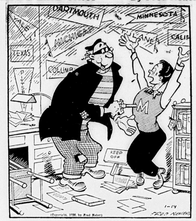
"I'm Just Workin' My Way Through College, Buddy."