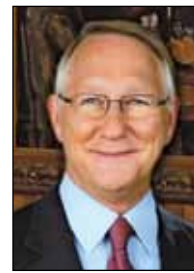
Gérald Tremblay Mayor of Montréal

Alan DeSousa, FCA Mayor of Saint-Laurent