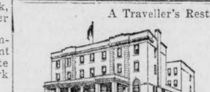
THE MANOR DRUMMOND is the new and modern hotel in the fastest growing town in Canada—where travellers like to week-end with luxury at moderate cost. Write to the Manager of the Manor, at Drummondville, Que.

Kellogg's ALL-BRAN is guaranteed to conquer constipation. Eat not less than two tablespoons every morning, and that amount at every meal. If the case is chronic, Kellogg's ALL-BRAN is delicious with honey and milk or cream. Sold at all grocers.