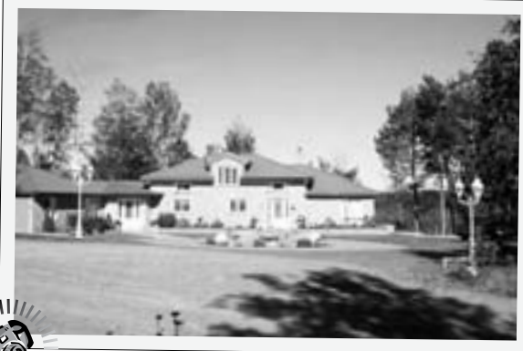
General views of the outside of your establishment from the front, back and side, if applicable.