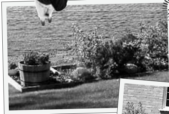
Close-up shots of landscaping (shrubs, rock gardens, flower beds, etc.)