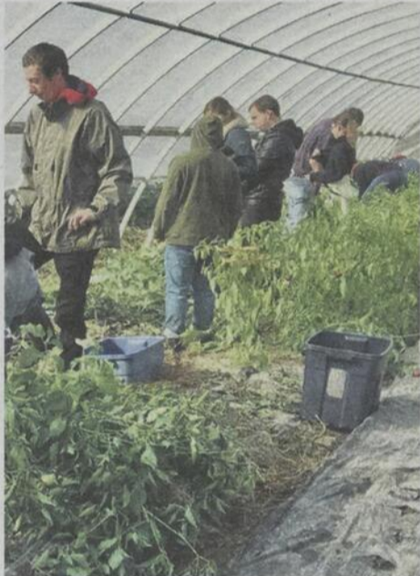
The students worked to clear eggplant and peppers from a greenhouse during their time on the micro farm in Elgin.