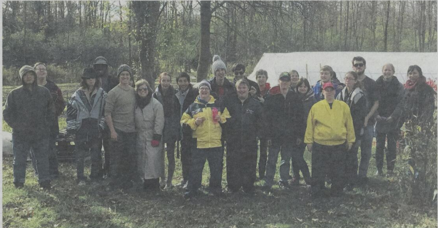
Students from the Options and Sunshine class at HAECC in Huntingdon took a field trip to the Jardins Glenelm organic farm on Friday, October 2.

AGRICULTURE. Culling end-of-season eggplants and peppers is not everyone's idea of a good time, but for twenty students from the Option and Sunshine Classes at the Huntingdon Adult Education and Community Centre (HAECC), the opportunity to work hard harvesting fresh food was a welcome experience.