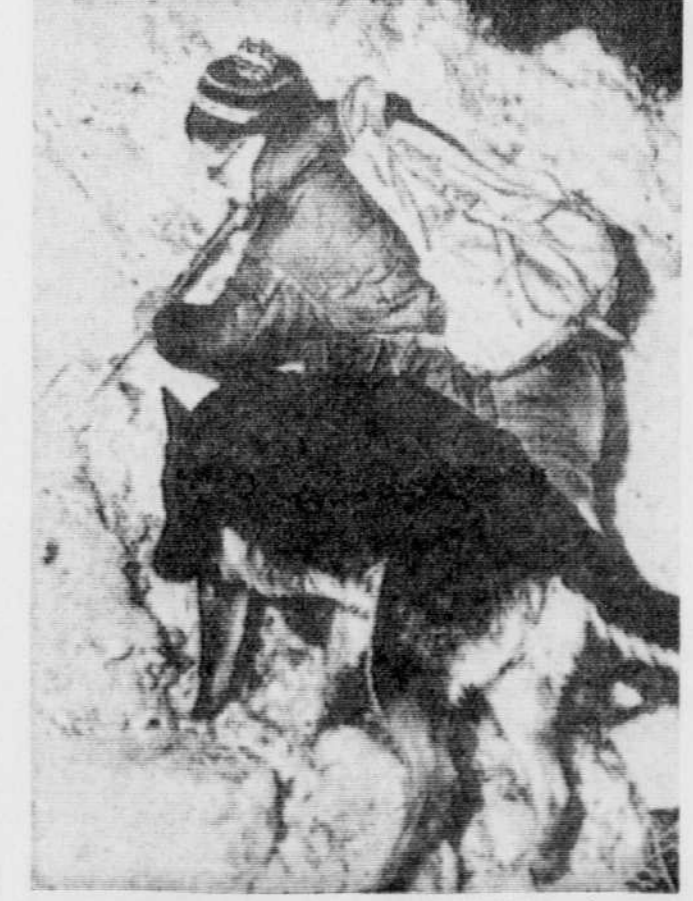
HUNT VICTIMS OF SWISS AVALANCHE — A rescue worker and a trained avalanche dog chip away at the rock-like glacier ice which hurtled down a mountainside near Saas Fee, Switzerland, Monday, and buried some 40 to 100 workers on a hydro-electric construction project. Rescuers worked through the night to find the victims, but little hope was held for their survival. Six bodies have been recovered.

The mass buried men, machines and barracks at the Mattmark power project near the resort. Some of the ice blocks were as large as two-storey houses.