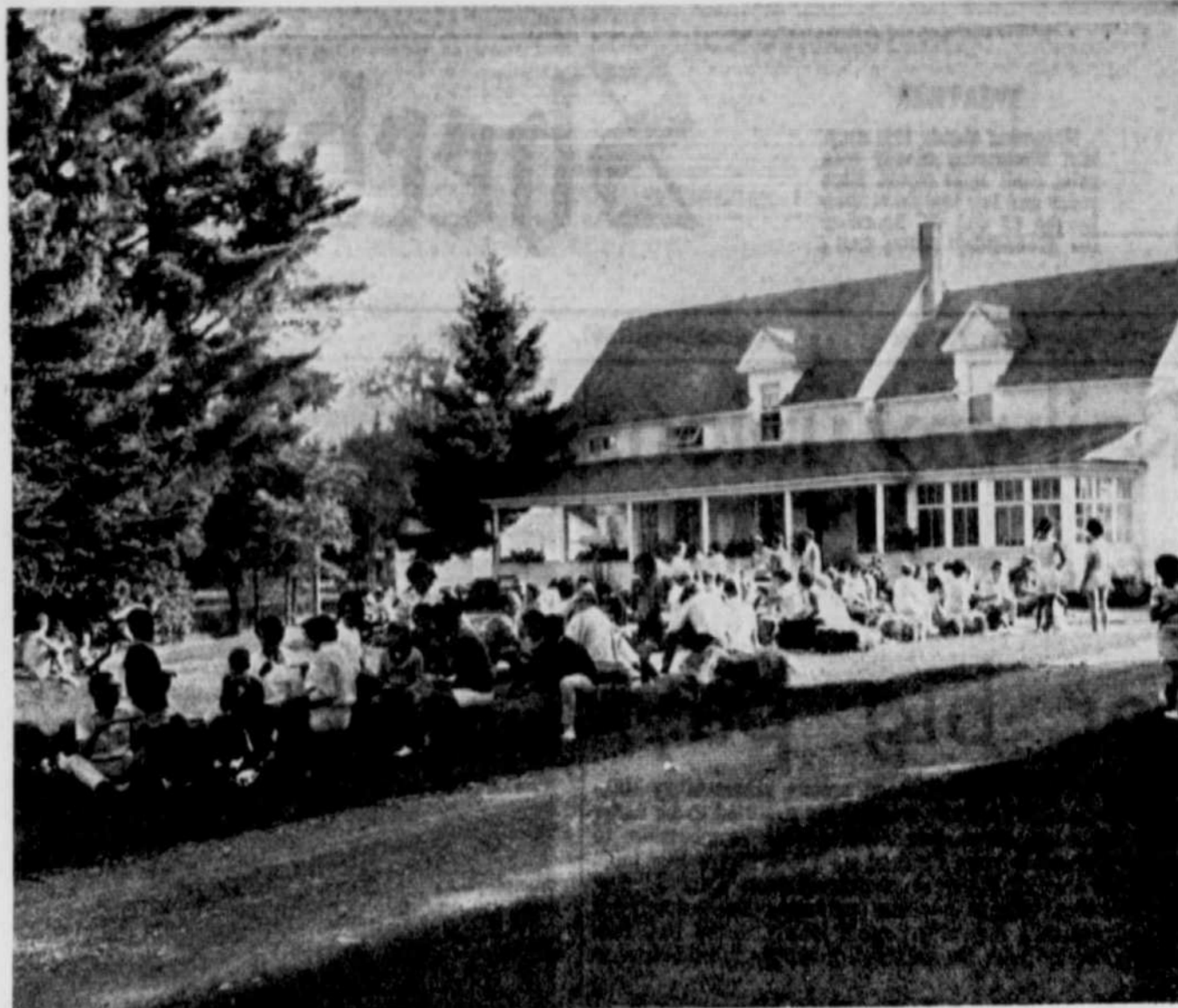
SCENE at Willowdale Farm, Bury, where a beef barbecue was held Aug. 21 for employees and families of