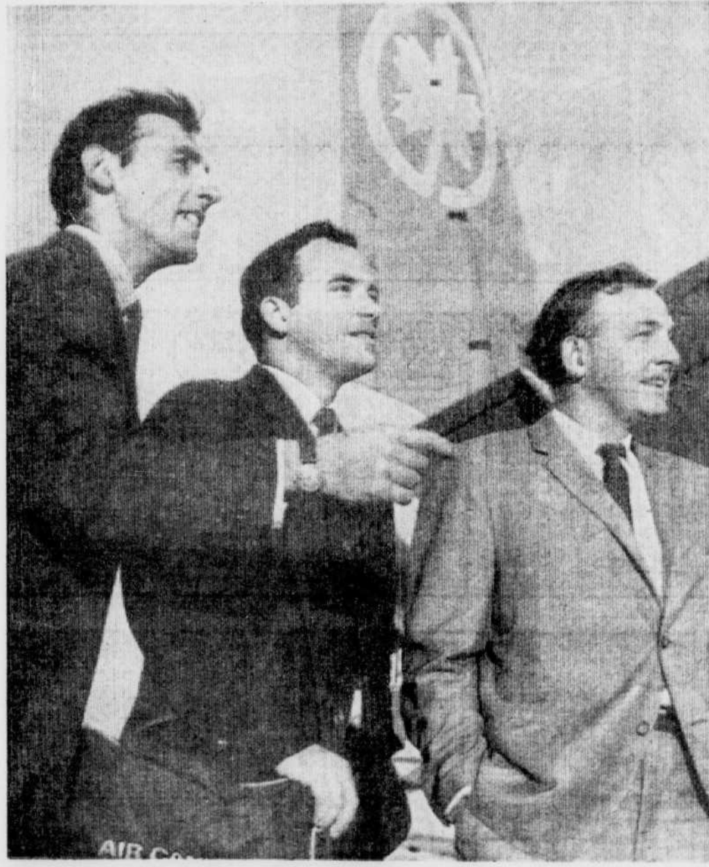
MONACO FESTIVAL—Three members of the 16-strong Montreal amateur theatre group Les Apprentis-Sorciers, picked from 1,500 amateur Canadian groups to represent

Packs represented were the First, Third, Fifth and Seventh Sherbrooke, First and Second Lennoxville and Waterville.