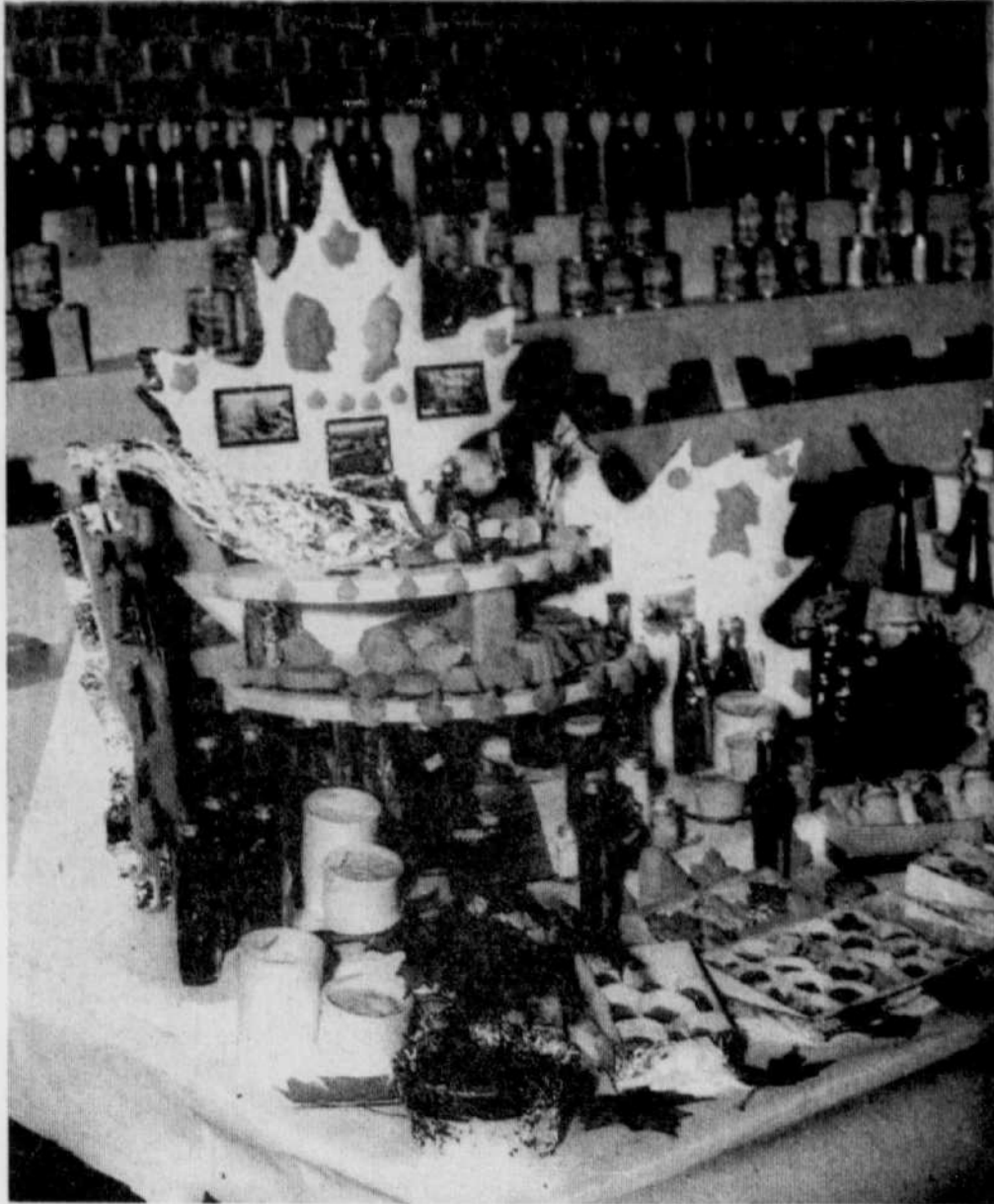
MAPLE DISPLAY — This first-prize display of maple products submitted by L. H. Jewett of Mansonville was

termed one of the best ever received in its class at the Sherbrooke Fair. It shows maple sugar wafers of different patterns and bottles of syrup, set off with maple leaves and branches.