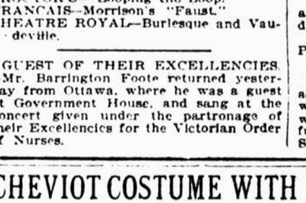
A walking suit of Cheviot in light weight with the new pleated skirt, and the three-quarter coat, in black and white, with a narrow milk moustache.