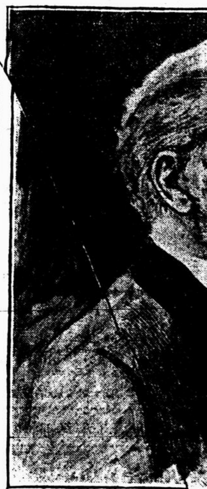
THE LATE SIR OLIVER MOWAT.

congregation of the province, and in every-thing that has to do with the public life of the province. I remember when the province was first organized, and how Sir Oliver Mowat was the first responsible government. He was the first to bring the province into the Confederation, and he was the first to bring the province into the Confederation.