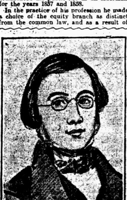
SIR OLIVER MOWAT. As He Appeared Sixty Years Ago.

CHOSE LAW FOR A CALLING. Choosing the law as his profession, he entered the office of the man who was to become his strongest opponent in the House of Commons, John A. Macdonald, at the time but 20 years old, while the young student was still in the law school of Toronto.