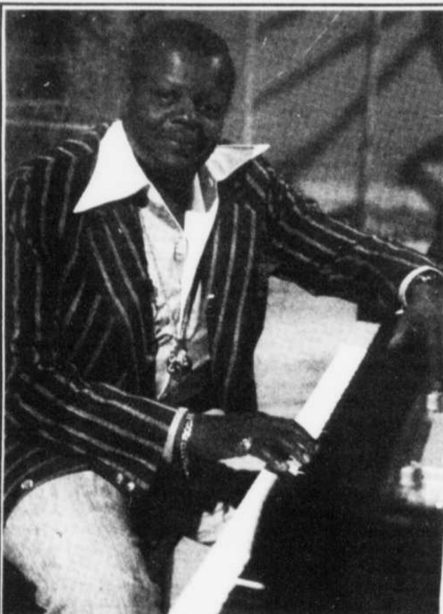
OSCAR PETERSON...three concerts