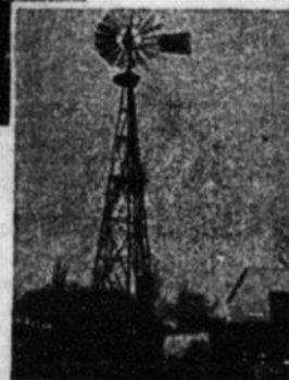
Beatty Pumper at work

Tests prove the Beatty Pumper is the cheapest way to pump water. This is the greatest improvement made in windmills in the last ten years.