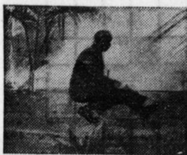
You must be lithe and limber to do these steps from the Hungarian Dance.

Those who wish to more particularly support the WITNESS may be interested in the advertisements appearing in this issue, some of which are making their first bow to our readers. Even requests for samples go to the credit of the publisher, showing that the subscribers offer a responsive market, and help the publishers to obtain more revenue to put to your service as well as introducing new ideas to the readers themselves.