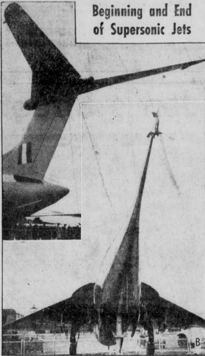
Beginning and End of Supersonic Jets

STRANGE SHAPES in jet aircraft seen at the recent Society of British Aircraft Constructors' show which brought aviation-minded visitors from all over the world to Farnborough, England. Top: Tail of the Handley Page Victor, giant four-engine crescent-winged bomber, already reported to have flown within a fraction of the speed of sound during development flights. Bottom: The long nose tapering down to the fuselage of Fairey Delta 2, supersonic single-seat research jet. It is nicknamed the "Droop-Snoot" because its nose can be lowered to give a good forward view.