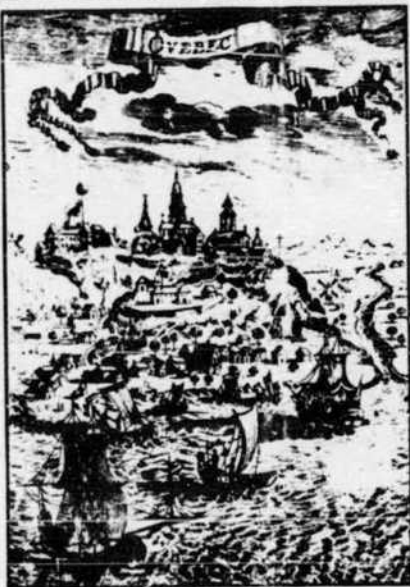
Bibliothèque Nationale du Québec