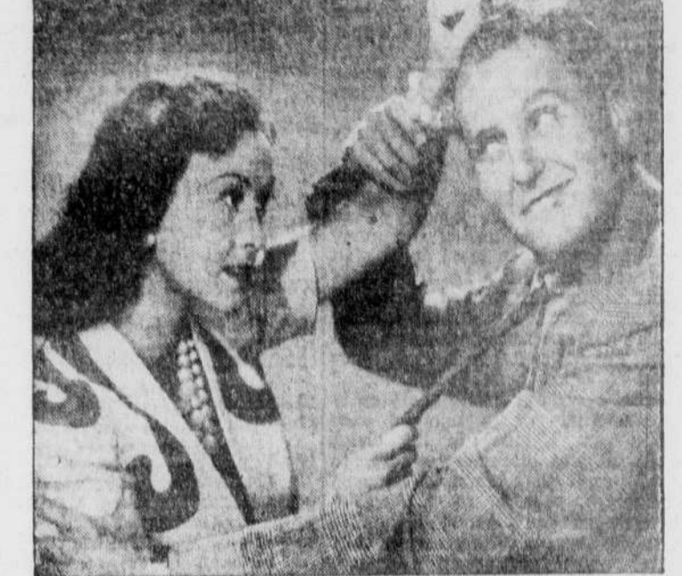
Margaret Lindsay and Ralph Bellamy in "Meet the Wildcat," at the New Premier Theatre.