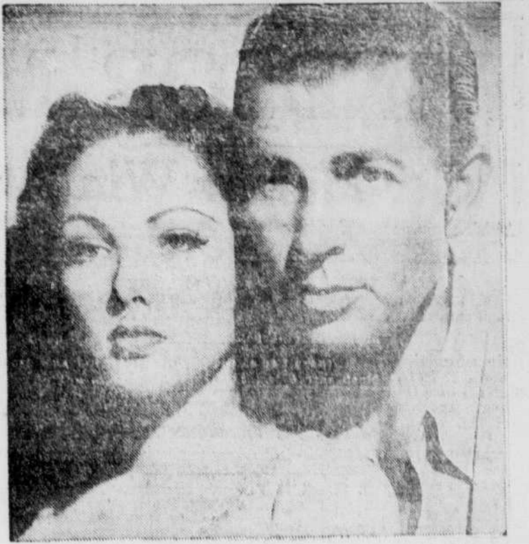
Bruce Cabot and Gene Tierney in "Sundown," now shown at the Granada Theatre.