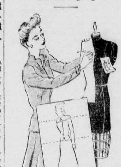
Chart Shows Rules To Follow

"A career in dress design" sounds so glamorous and far off. But it's what you want, you CAN achieve it.