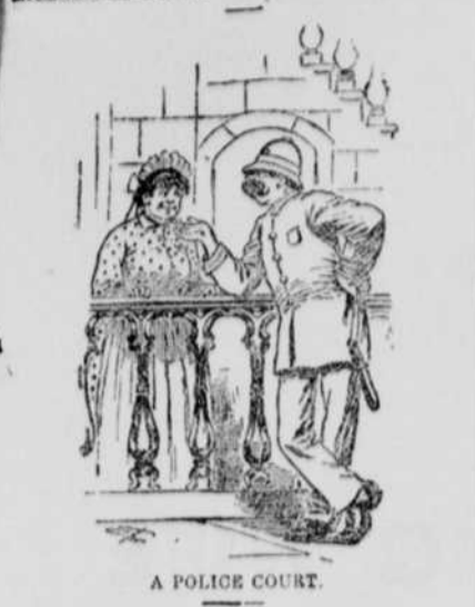
A POLICE COURT.