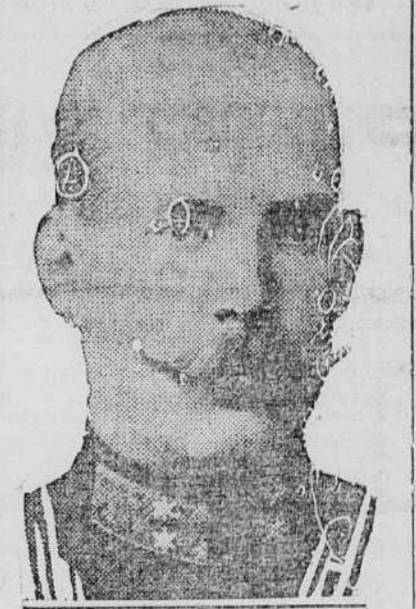
KING CONSTANTINE OF GREECE, Whose army is about to join with the Allies

TO-DAY Henry B. Walthall FEATURED IN A BEAUTIFUL COMEDY-DRAMA "The Woman Hater" IN THREE PARTS. Dreamy Dud Sees Charlie Chaplin AND THE SIXTH CHAPTER OF The Goddess