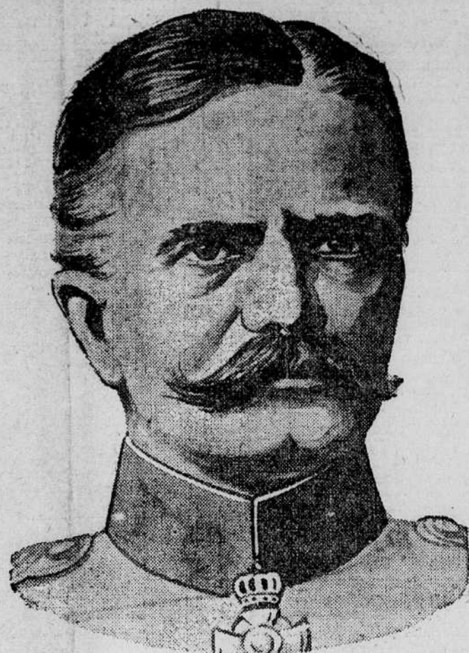
GENERAL VON MACKENSEN, Who Will direct operations against Serbia

According to reliable information, one hundred thousand German troops