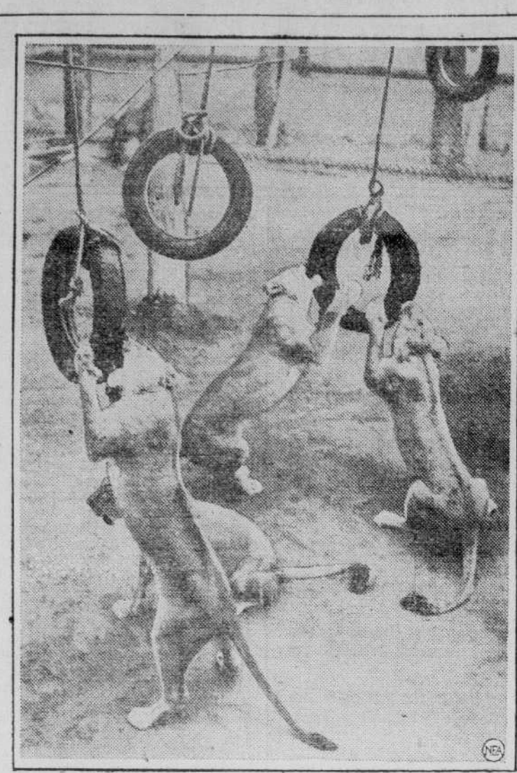
To a human being, tussling with an auto tire is anything but fun. But to these two-year-old jungle monarchs, frolicking on the El Monte, Calif., lion farm, a few discarded auto tires provide roval sport and vital exercise.