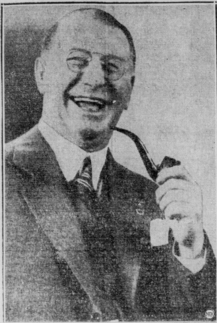
Col. Frank Knox, if he should be the next Republican nominee for the United States presidency, will be presenting a smile rivaling Roosevelt's. This informal portrait study, newest and best picture of the Chicago publisher, shows his mood as he attacked in recent speeches the "reckless spending and mounting bureaucracy" of the New Deal.

responded rather closely with the increase in the value. The best available method of appraising the trend of Canadian trade is to compare the statistics for the first ten months of 1935 with the level of the same period of the preceding year.