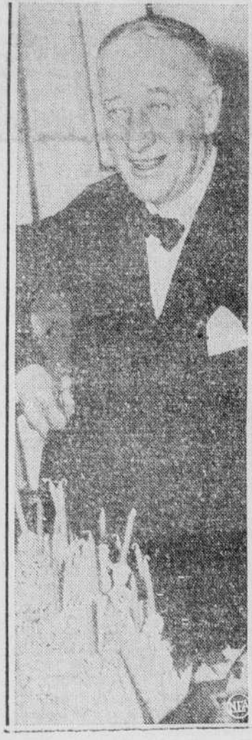
Alfred E. Smith, 1928 Democratic presidential nominee, marked above cutting a birthday cake, shown his sixty-second birthday by declaring open war on the Roosevelt administration. Taking issue with the President's statement that Smith had been invited as a guest to the White House, the former New York Governor made it clear he would not support Roosevelt for the Democratic re-nomination.