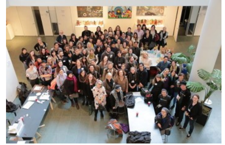
Art+Feminism gathering in New York

It's also due to a combination of facts: only 10 percent of Wikipedia editors are women; in America, anyway, we don't really have a culture that values art, and space issues. A web character from Grand Theft Auto has five hundred citations, but that's not true of someone who's an important artist. I think there are a number of issues.