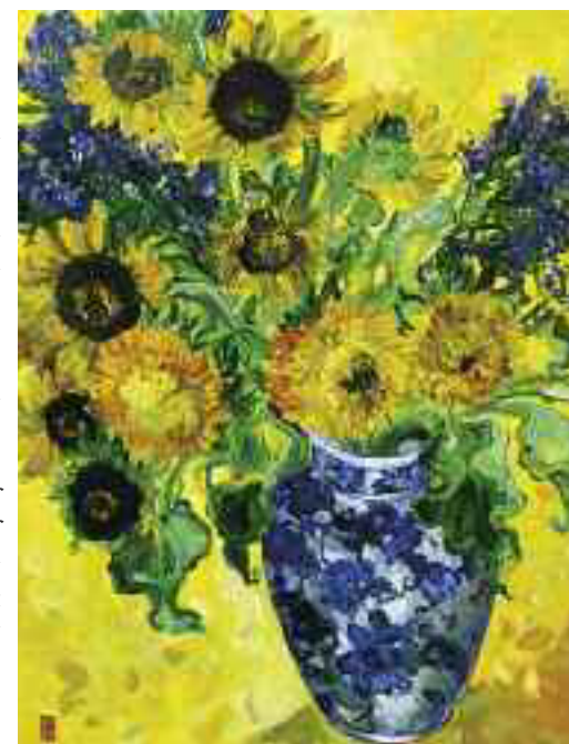
“A Means of Hope”