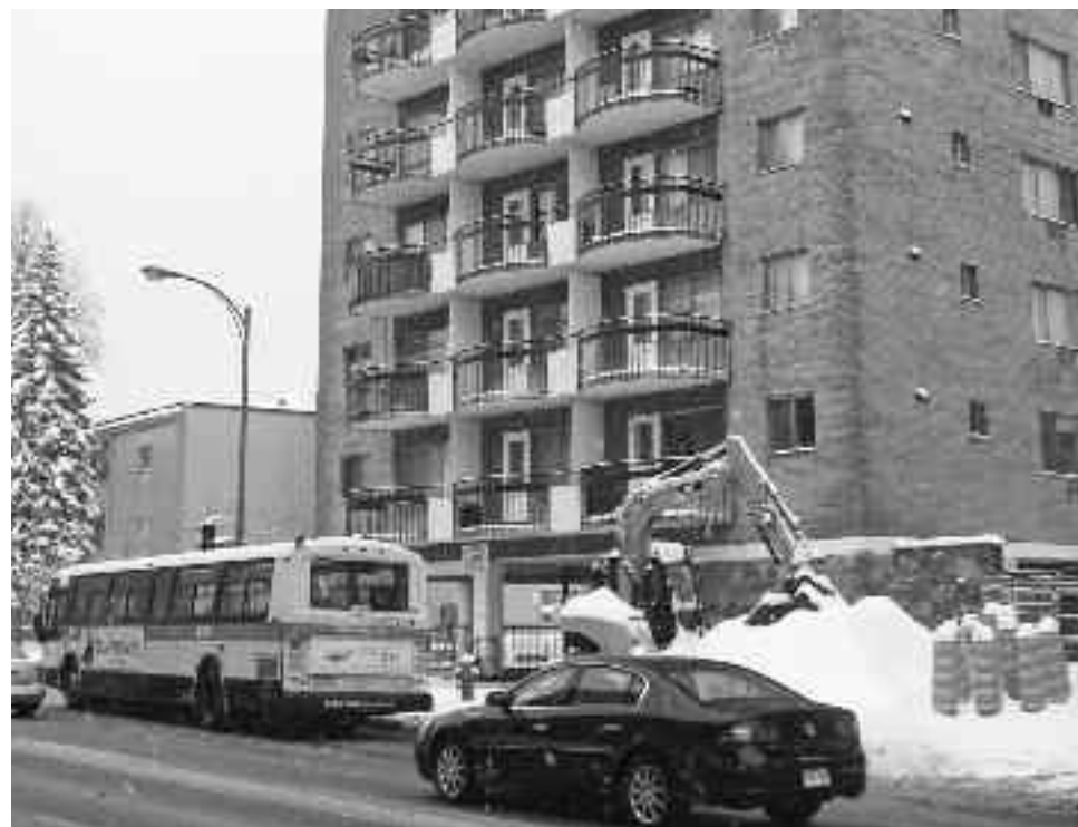
This building at 4400 St. Catherine St. near Westmount High is being excavated around its foundation in spite of the bad weather. A resident explained that it was a soil remediation project. Building management did not return calls for comment.