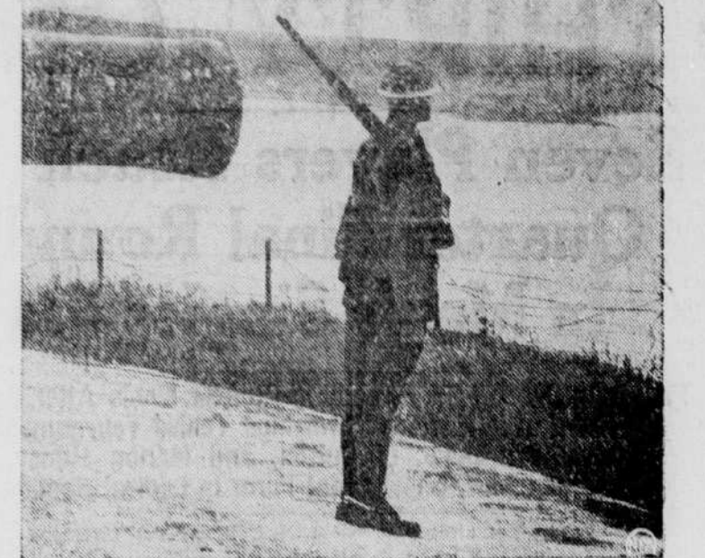
Behind a barbed wire barrier, an Irish sentry stands guard on the shores of Eire, neutral southern part of Ireland, as the country keeps vigil against possible invasion.