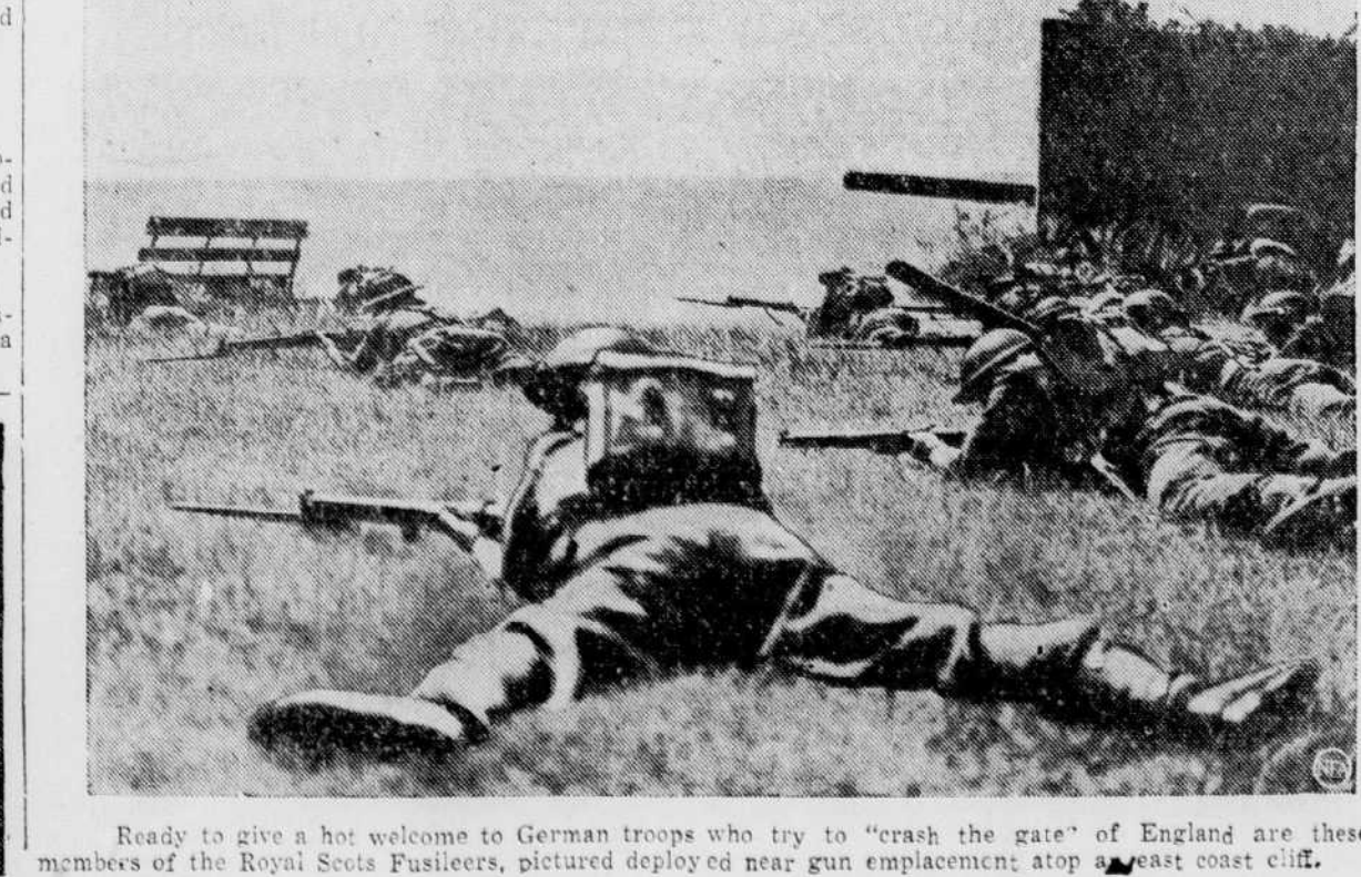
Ready to give a hot welcome to German troops who try to "crash the gate" of England are these members of the Royal Scots Fusiliers, pictured deployed near gun emplacement atop a east coast cliff.