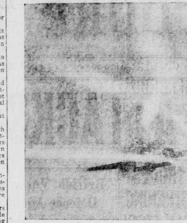
Smoke from tracer bullets weaves a pattern of death around this German Messerschmitt plane caught in concentrated machine-gun fire from British Hurricanes and Spitfires. According to British-censored caption, photo was taken by automatic camera-gun aboard one of the British fighters.