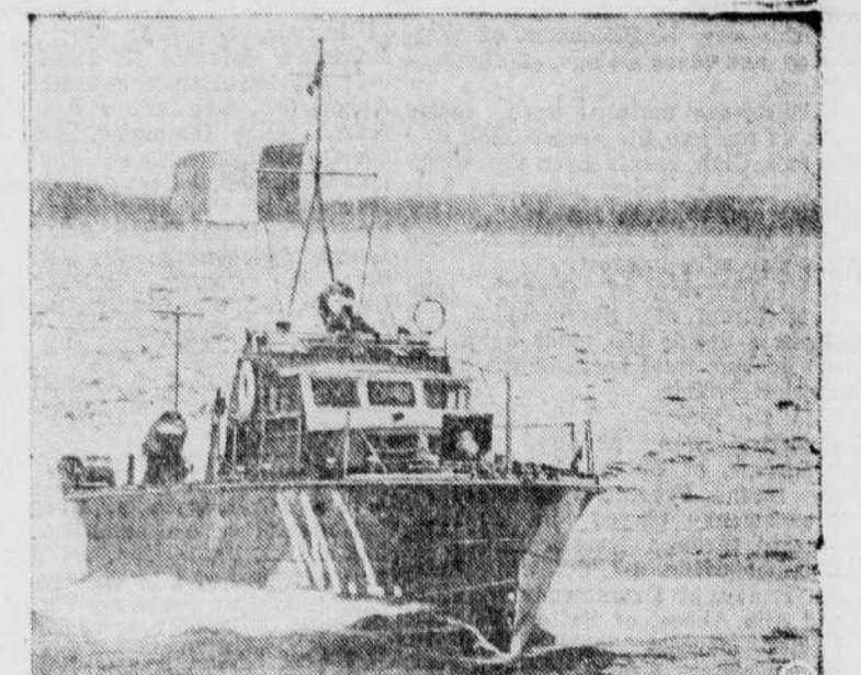
From the decks of swift motor torpedo boats, like this one, keen eyes of Eire's seamen watch for periscopes of invader's submarines. "Mosquito" boats are Eire's "sea scouts."