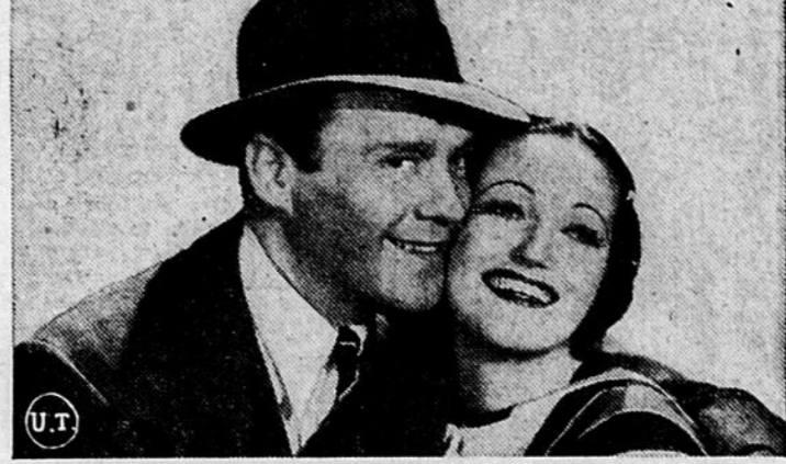
Jack Benny and Dorothy Lamour in a scene from the film "Man About Town," which is now playing at the York United Theatre, until Friday.