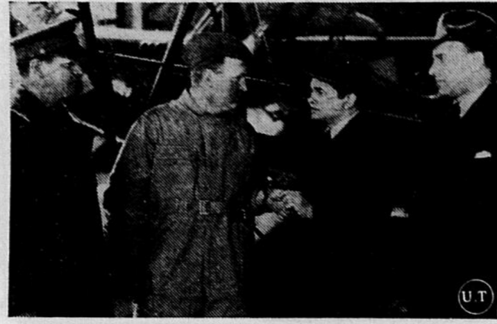
A scene from the film "The Confessions Of A Nazi Spy," starring Edward G. Robinson and Francis Lederer, which opens Sunday at the Monkland United Theatre for a three day engagement.