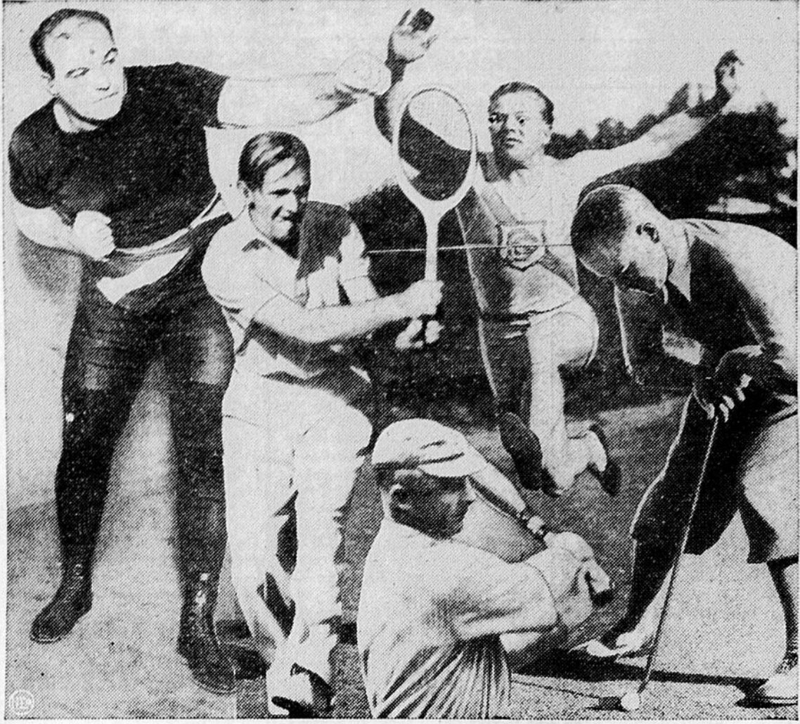
The stars don't always conform to the book to get results. Jim Jeffries' crouch led him to the heavy-weight championship. Jack Bromwich confounds tennis experts with his two-handed "baseball" grip. Charley Paddock had his famed "flying finish." Heinie Groh went to town with his curious "bottle" bat and Leo Diegel rose to golfing prominence with his crablike putting stance and pendulum stroke.