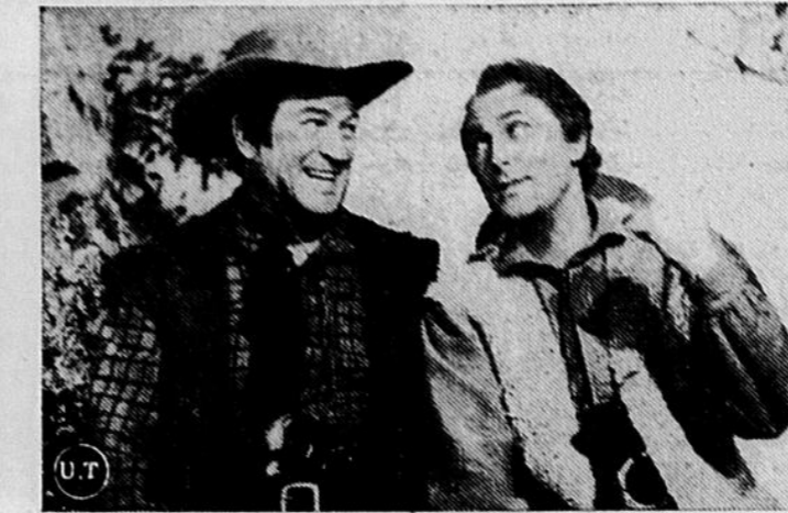
Victor McLaglen and Brian Aherne in a scene from the film "Captain Fury," opening Sunday at the Snowdon United Theatre.