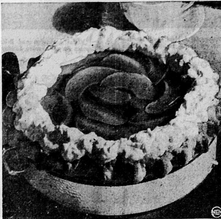
Peaches in a regal dress—a fresh peach glaze pie with fluting of cream. Late August in its finest aspect.

Want a Peach of an Idea for Dessert? Then Surprise the Folks With One of These!