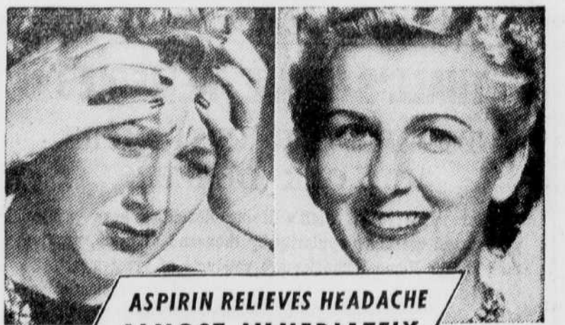
ASPIRIN RELIEVES HEADACHE ALMOST IMMEDIATELY

Genuine Aspirin now at a low price! Now drastically reduced prices on genuine ASPIRIN make it easier than ever for you to obtain fast, efficient relief from the pain of headache, neuritis, or neuralgia. Perhaps you have never tried Aspirin yourself. Then you'll be delighted when you discover the speed with which genuine ASPIRIN gets to work relieving pain.