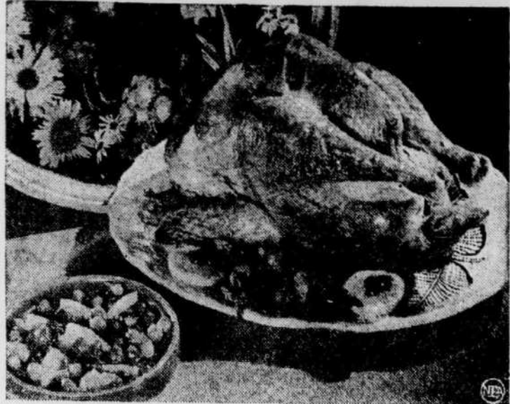
Mandarin sauce is special addition to roast turkey.