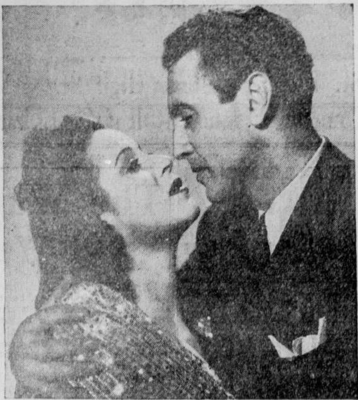
Kitty Carlisle and Allan Jones co-starred in feature film beginning tomorrow at the New Premier Theatre.

Diversion seekers will find merry, melodious entertainment in "Larceny with Music," which comes to the New Premier Theatre tomorrow. The story has to do with night-club performers and is enacted by a group of top notch players many of whom are nationwide favorites. Allan Jones, Kitty Carlisle and Leo Carrillo are co-starred.