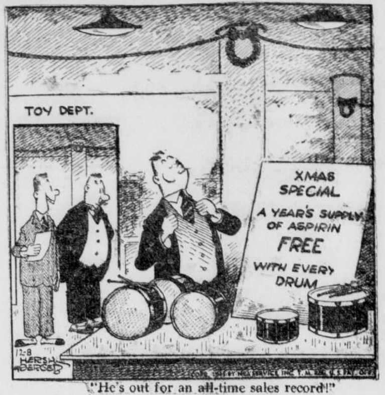
"He's out for an all-time sales record!"