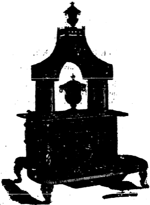
Parlour Stove with Folding Doors , for wood or coal.