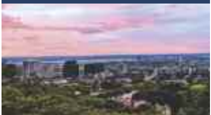
MODERN RESIDENCE | VIEWS $4,980,000* WESTMOUNT | LISTED AND SOLD BY US