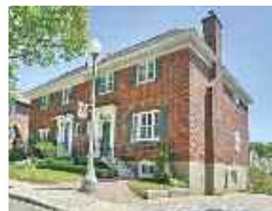
Westmount, 20 Thornhill Ave. Impeccable 3+1 bdrm 1923 home. City views, + sunny SW exposure, large garden. Reno'd kitchen + bathrms. Oak woodwork, leaded windows. 2 car prkg. $1,250,000