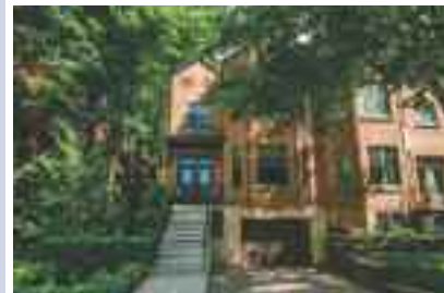
FAMILY HOME ON THE FLAT $1,898,000 WESTMOUNT | MLS 12191934