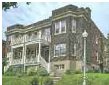
Westmount, 11 Parkman Place SPACIOUS 4 bdrm upper duplex. Oak flrs, leaded windows. New roof, plumbing, furnace. A LARGE unfinished bsmt. Competitively priced + huge potential! $529,000