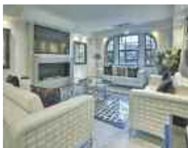
Downtown, Le Chateau SPECTACULAR! THE ULTIMATE in high end luxury living at Downtown's premier address. TOTALLY renovated 1,550 sq ft 1 bdr co-op apt. Truly breathtaking. $1,095,000