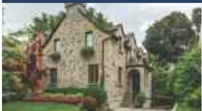
IMPRESSIVE STONE RESIDENCE $1,695,000 OLD HAMPSTEAD | MLS 25866113