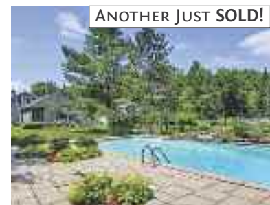
West Bolton, ET, 271 Spicer Rd. Idyllic 39 acre estate. Ponds, swimming pool, tennis court, main house + guest cottage. No finer combination of comfort, privacy, + privilege at this price. $1,495,000