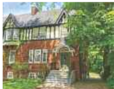
Westmount, 707 Victoria Ave. Delightful S/D property offering EXQUISITE architectural details, beautifully spacious rooms, numerous upgrades. 3 bdrms, 3½ bathrooms, garage + parking. $1,159,000