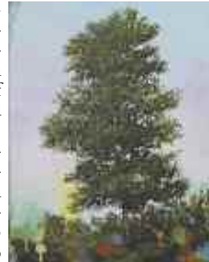
Peter Hoffer "Portrait (3)"

imagery, Hoffer personalizes the impersonal with a novel use of colour and textured surfaces. This interesting exhibition continues until August 25 at 1366 Greene Ave.