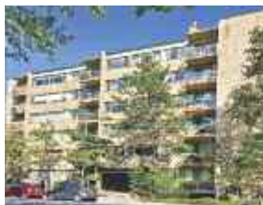
Westmount, 4444 Sherbrooke W. #106 Rarely available + desirable! Spacious, fully reno'd 3 bdrm, 2 bath co-op. Well run door-man bldg, roof pool, views. Impeccable! Garage, locker. Washer/dryer. $550,000