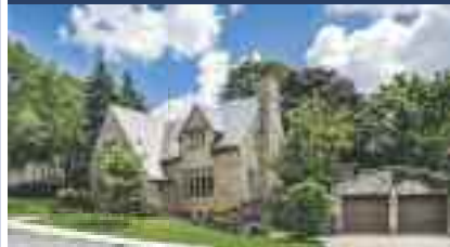
TRADITIONAL STONE RESIDENCE $2,498,000 WESTMOUNT | MLS 20100760 OR $7,000/MO