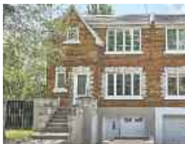
NDG, 5310 O'Bryan Ave. Exceptional find! Sun filled, FULLY renovated, enlarged with a 3 storey extension. Stunning bathrooms, kitchen, new windows, halogen lighting, newly built garage... $695,000