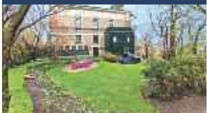
UNIQUE HISTORIC RESIDENCE $2,150,000* WESTMOUNT ADJACENT