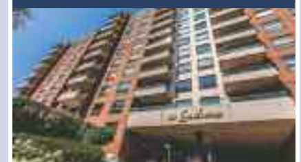
SPECTACULAR CORNER UNIT $975,000** WESTMOUNT