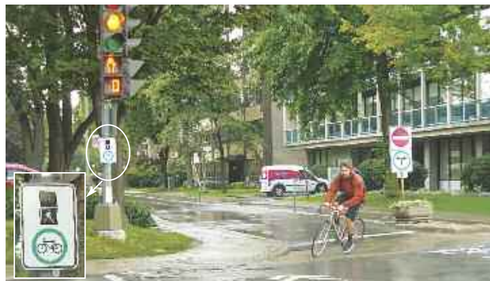
Seen looking east from Claremont August 14, this cyclist crosses over from the Westmount bike path on the south side of de Maisonneuve to link up with the NDG portion on the north side. Inset: the new sign.

Dan Lambert, president ..... of the Westmount Walk- continued on p. 14