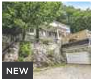
ANWOTH, WESTMOUNT $1,595,000