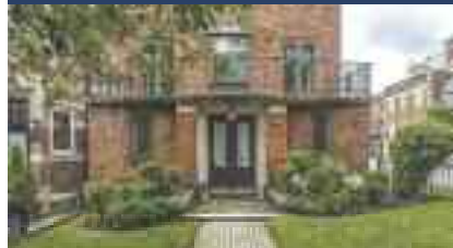
METICULOUSLY RESTORED HOME $2,895,000 WESTMOUNT | MLS 16194156