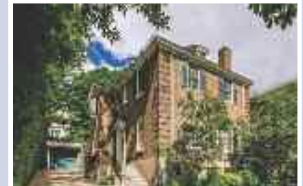
SUPERB DETACHED HOME $1,785,000 WESTMOUNT ADJ. | MLS 27006242