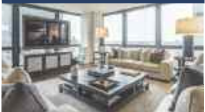
RARE 4-BDRM UNIT | VIEWS $1,798,000 WESTMOUNT SQUARE | MLS 27967283