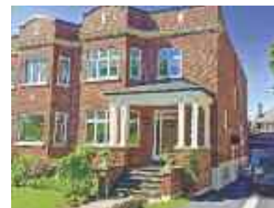
Westmount, 646 Lansdowne Ave. Perfectionist owned home, FULLY renovated, done in top quality and sparing no expense! 4 bdr, 3½ bathrooms, garage + 3 car parking. $1,789,000