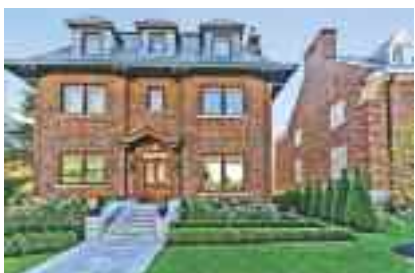
MAJESTIC GEORGIAN MANSION $4,800,000 WESTMOUNT | VIEWS | MLS 26499690