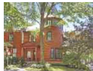
Westmount, 234 Metcalfe Ave. STUNNING, architectural marvel blending 21st c. cutting edge design with Victorian elegance. Renov. from top to bottom. 5 bdrm, 4½ baths. 2 car garage + pkg. $1,399,000