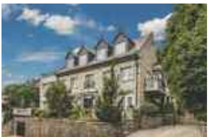
MAJESTIC GEORGIAN | VIEWS $4,395,000 WESTMOUNT | MLS 10345086