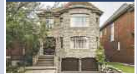
METICULOUS CUSTOM-BUILT $1,029,000 NORTH HAMPSTEAD | MLS 22396493