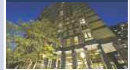
FABULOUS PH ON 2 LEVELS $9,000/MO WESTMOUNT | MLS 15432839