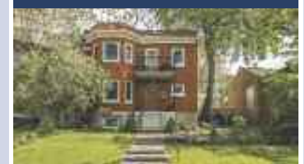
EXCEPTIONAL FAMILY HOME $1,049,800 MONKLAND VILLAGE | MLS 23721170