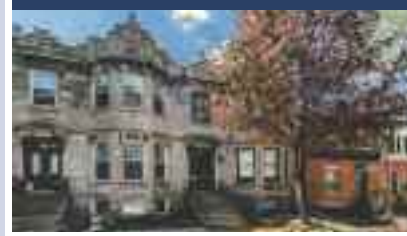
OPPORTUNITY ON THE FLAT $1,695,000 WESTMOUNT | MLS 12075304