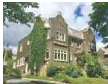
Westmount, 7 Douglas Ave. Fully renovated, "John Hand" built home. Exceptional woodwork/stained glass. Peaceful, family friendly location. 4 bdrms, 3½ bathrooms. Garage and garden. $1,345,000