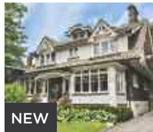
HILL PARK CIRCLE, WSTMT ADJ. $1,485,000