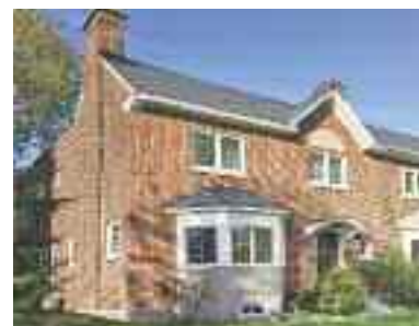
Westmount, 557 Lansdowne Ave. RARELY available. PRIME mid-level location! Remarkably spacious, extensively renovated 4 + 1 bdr. Large garden. 2 car garage. Close to King George Park + the best schools. $1,595,000