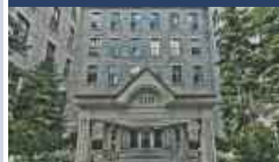
SUPERB 2 BDRM UNIT $1,295,000 MANOIR BELMONT | LISTED AND SOLD BY US