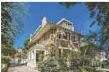
GRACIOUS FAMILY HOME $3,298,000 WESTMOUNT | MLS 26212762