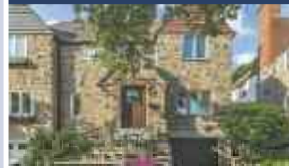
CHARMING STONE SEMI $1,595,000 WESTMOUNT | EXCLUSIVE