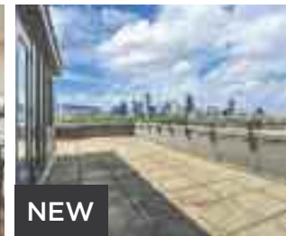
“SOLANO”, OLD PORT $2,250,000