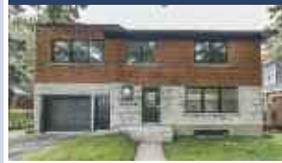
TURN-KEY FAMILY HOME $799,000 MONTREAL WEST ADJ. | MLS 21318931