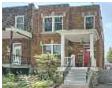
NDG, 4196 Beaconsfield Ave. One of the prettiest homes in NDG. MOVE-IN condition. 4+1 bdrs. Beautifully renov. kitchen + bathrms. Ideal Monkland Village location. Original wdwrk + charm. $839,000