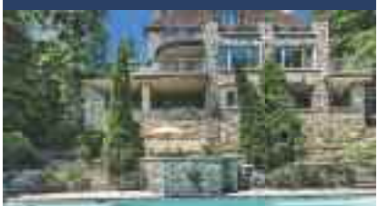
CLASSIC DREAM RESIDENCE | VIEWS & POOL $6,548,000 WESTMOUNT | MLS 26978947