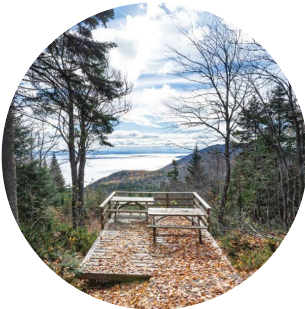
Sentier des caps de Charlevoix