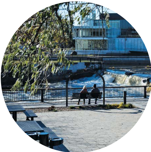
Place des Moulins in Joliette

The program was thoroughly revised in 2018. You will find all the details and the new terms and conditions that went into effect October 1, 2018, in the following pages.