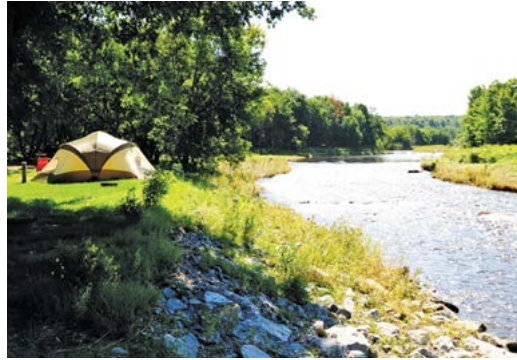
Participation in the restoration of the Rivière Noire in Roxton township