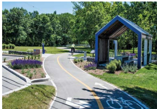
Rest stop on the TransTerrebonne bike trail