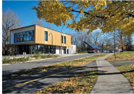
Parcours Gouin visitor center

The proposed initiative must achieve a permanent, long-term result and, as much as possible, provide visibility for Hydro-Québec. Consequently, event sponsorship, purchase of consumable materials and execution of studies, inventories, plans and research unrelated to the proposed initiative are not eligible.