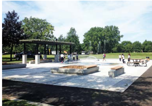
Creation of Place Paul-Déjean in the Rivière-des-Prairies-Pointe-aux-Trembles borough