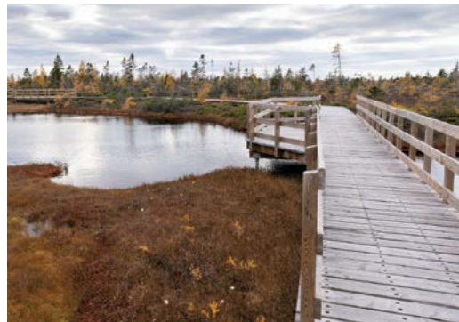
Grande plée Bleue trail in Lévis