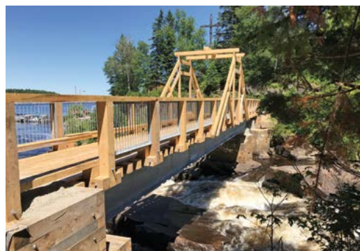
Walkway at chute à Ménard in Saint-Michel-des-Saints