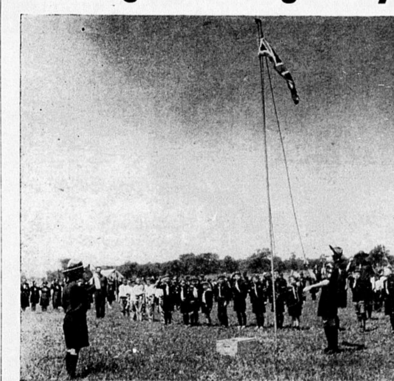
Guides, Cubs, and Scouts assembled for the Flag Break at the opening of the third District Rally held at Ormstown on June 22nd.

Rallies are intended to bring people together for a special purpose and this was the case on Saturday, June 22nd, 1957.