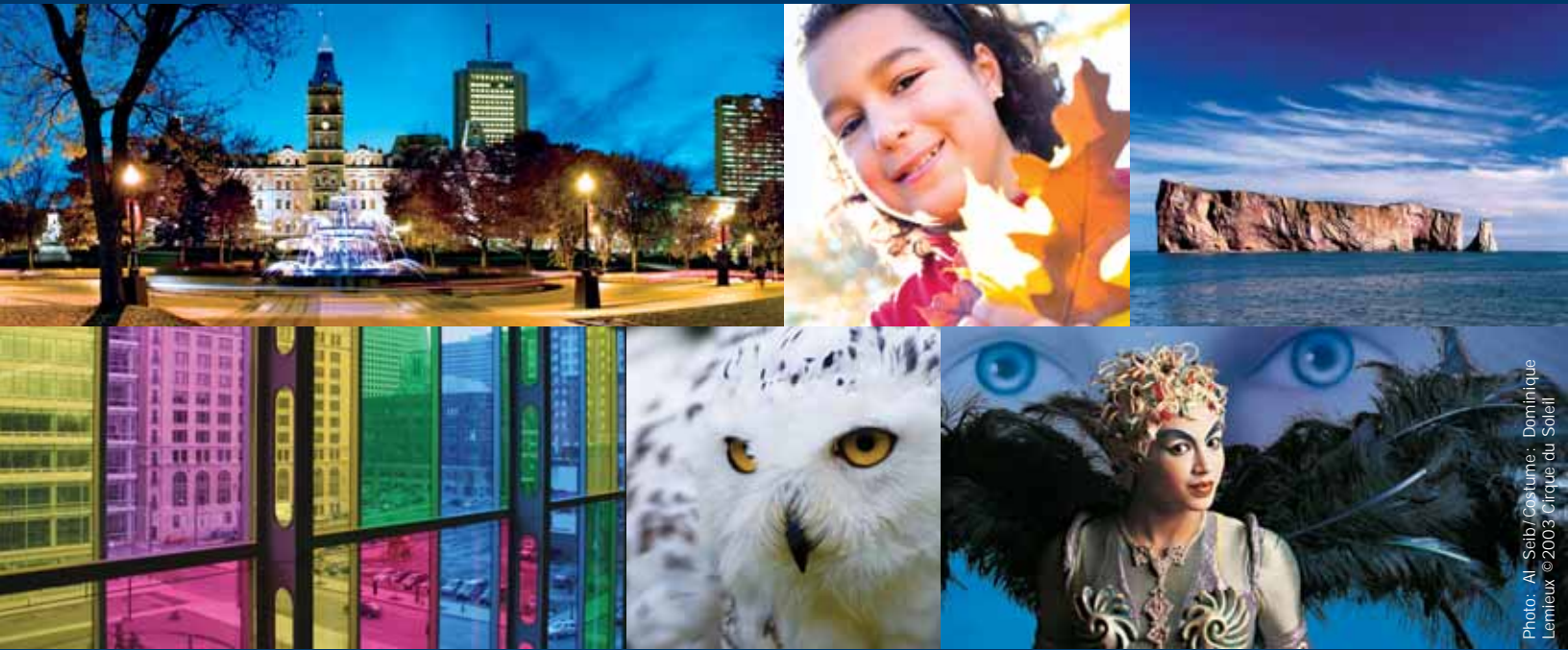
Costume: Dominique Lemieux