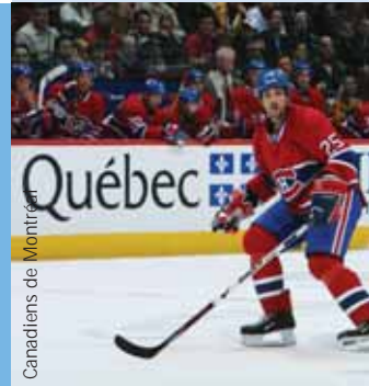
Canadiens de Montréal

Quebecers are passionate ice-hockey fans, and the Montréal Canadiens, a club founded in 1909, is North America's second most successful professional sports team