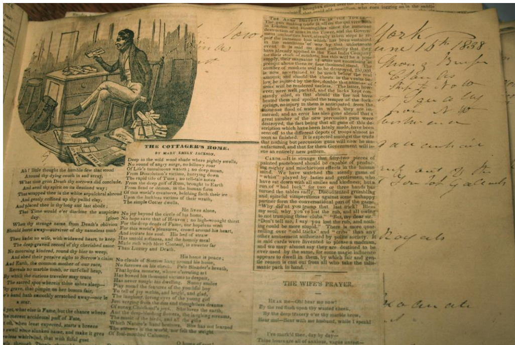
Figure 2. Notices of Loveland’s editorial position, loose in the scrapbook

plausibly posit a great deal. Its author hails from a relatively privileged position, and is clearly more invested in reading and writing—and social reform—than the bulk of the populace. Nonetheless, her scrapbook and her published writings together reveal nonobvious connections, resistant readings, and productive tensions that may provoke us to see how the popular news media, even today, may mean more than they know. 13