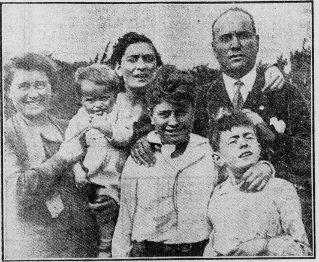
Whether Benito Mussolini can dictate in his own home the way he does for the rest of Italy is not a generally known fact, but the family seem happy about it anyway. This photograph was taken recently at their estate at Forli, Italy. In the back row are Donna Rachelle, with the baby Rom in her arms, their daughter and Italy's premier himself. In front are Bruno and Vittorio. Romano, the baby, recently celebrated his first birthday.